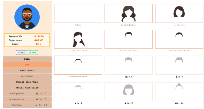
Figure 1: Tool section dedicated to the avatar's customization