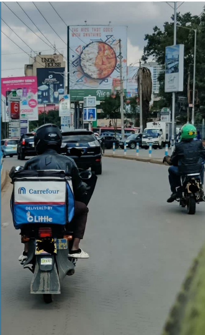
A platformed e-commerce delivery motorcycle in Nairobi