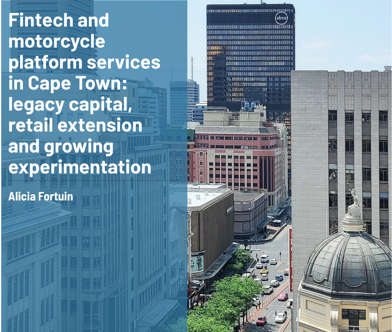
Adderley Street, Cape Town CBD