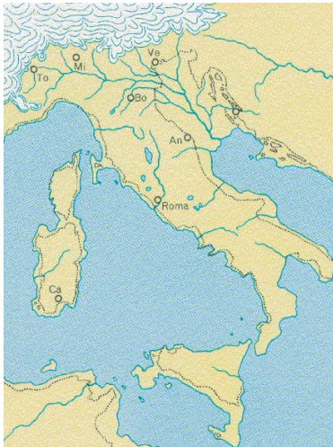
Quaternary glaciations in northern Italy (from http://www.pantalica.org/gliaciazioni )

*Corresponding author: valentina.balestra@hotmail.com ; valentina.balestra@polito.it