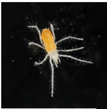
Troglocheles n. sp.

In 2009, the mites were analyzed by the specialist Miloslav Zacharda of Prague, establishing all the collected specimens were a species new to science, described in 2011 as Troglocheles lanai .