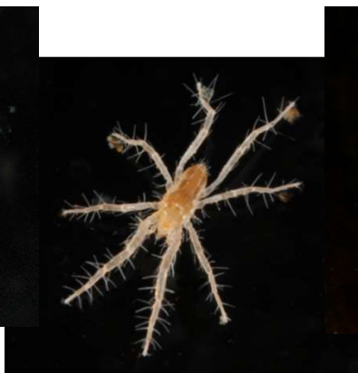
Traegaardhia n. sp.