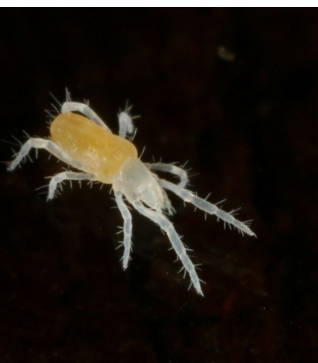
Robustacheles n. sp.

Hundreds of Rhagidiidae specimens were found in over 90 underground stations and cavities since 2014, including other species new to science belonging to the genus Troglocheles , Traegaardhia and Robustacheles .