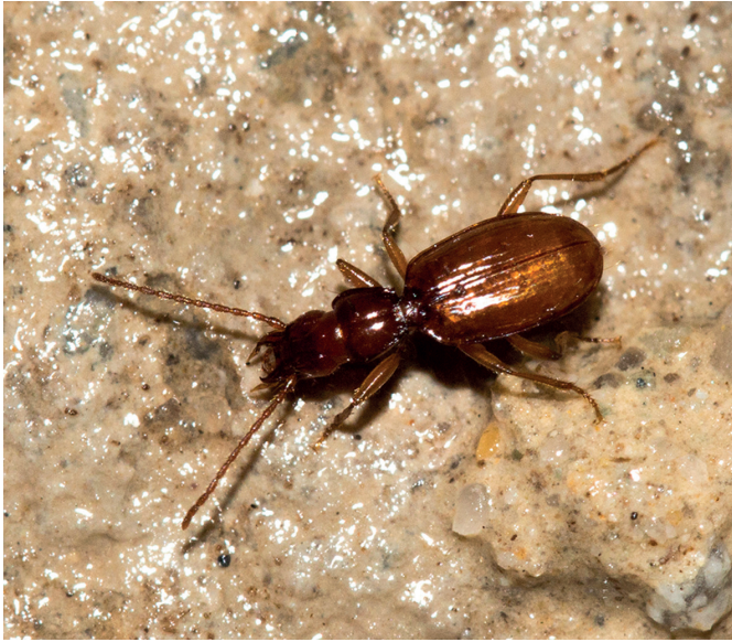
Fig. 6 – Duvalius carantii

cialized diplopod widespread in most of Italy; in the Western Alps it is present in the Cottian, Maritime and Ligurian Alps and in Piedmont it was reported in about 50 underground stations (Lana et al. , 2021). It secretes a whitish repellent substance of nauseating smell which is at the origin of its name; it is pigmented, has small eyes and can exceed 50 mm of length.