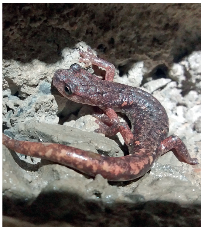
Fig. 8 – Speleomantes strinatii