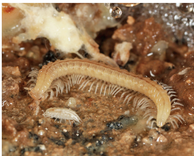
Fig. 5 – Plectogona vignai draco and Trichoniscus voltai

ment in the Western Alps: it has a 3.5 mm long depigmented body and atrophic eyes reduced to diaphanous scars. It weaves its thick webs in horizontal drape, in wall recesses or between big stones on the ground, and catches dipterans and small insects. New stations of this arachnid were found in different Gesso and Vermenagna Valleys caves (Arnò e Lana, 2005; Isaia et al. , 2011; Lana et al. , 2021). Typhlonesticus morisii (Brignoli, 1975) (fig. 4) was discovered by AM in 1972 and dedicated to him. This spider weaves sparse webs formed by single threads, creating a three-dimensional network with which it mainly catches especially flying insects. It is one of the most underground life adapted spiders in the Western Alps: it has about 5 mm long totally depigmented body, with atrophied eyes. For over thirty years it was considered an exclusive endemic of the FOP11, however, in the last decade new stations in Ellero and Vermenagna Valleys were found