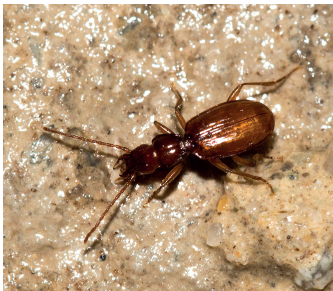
Fig. 6 – Duvalius carantii

cialized diplopod widespread in most of Italy; in the Western Alps it is present in the Cottian, Maritime and Ligurian Alps and in Piedmont it was reported in about 50 underground stations (Lana et al. , 2021). It secretes a whitish repellent substance of nauseating smell which is at the origin of its name; it is pigmented, has small eyes and can exceed 50 mm of length.