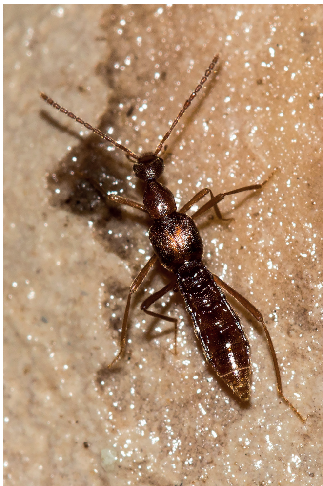
Fig. 7 – Blepharhymenus mirandus

At the entrances, it was possible to observe the cave salamander Speleomantes strinatii (Aellen, 1958) (fig. 8), a protected amphibian whose biology is closely linked to hypogean environment.