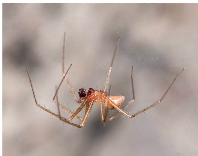
Fig. 3 – Troglodyphantes konradi