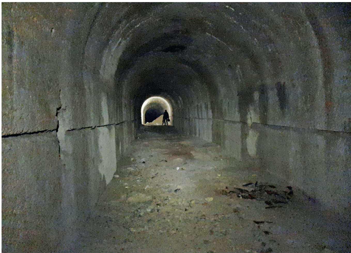
Fig. 1 – The military subterranean fortification Forte di Vernante Opera 11 “Tetto Ruinas”

their conservation, monitoring and detecting caves and artificial cavities. The military subterranean fortification Forte di Vernante Opera 11 “Tetto Ruinas” (FOP11) has different publications about its hypogeal fauna. The aim of this study is to monitor over time the presence of all previously mentioned in bibliography organisms, and to document the presence of other species, due to biotic and abiotic environmental factors in the artificial cavity, highlighting the most subterranean life adapted species.