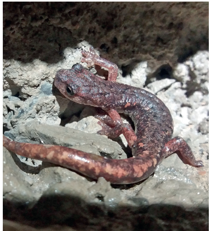
Fig. 8 – Speleomantes strinatii