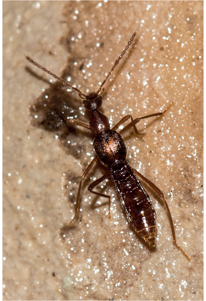
Fig. 7 – Blepharhymenus mirandus

At the entrances, it was possible to observe the cave salamander Speleomantes strinatii (Aellen, 1958) (fig. 8), a protected amphibian whose biology is closely linked to hypogean environment.