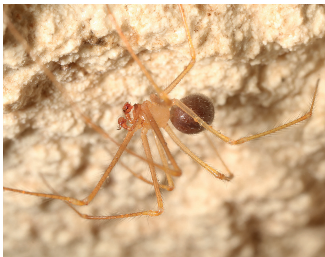
Fig. 4 – Typhlonesticus morisii