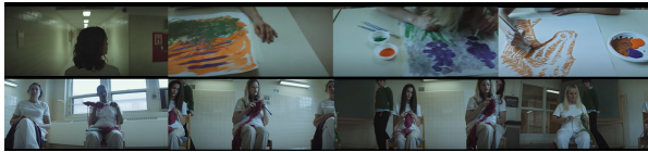
Figure 8. Segment from Thoroughbreds https://www.youtube.com/watch?v=1bBOUr7rAHw , from the 0:30 to 1:00