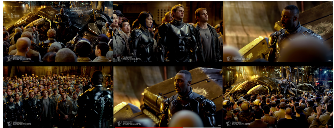
Figure 10. Segment from Pacific Rim. For a better visualization https://www.youtube.com/watch?v=-7Sow81yi24 , from 1:30 to 2:00

humans, usually representing dialogues. In this scene, we have a much slower pace with respect to segment 1 and the focus is more on the characters rather than the global context. If we take two segments from different classes that come from the same basic editing pattern cluster we notice fewer differences. The segments shown in 1 are extracted from class 43, which is entirely created from basic editing set 8. The complete segments are reported in Figure 8 and in Figure 9. The scene segment represented in both cases contains mainly medium shots of people interacting with objects. The fact that the two segments end in the same way is partly coincidental. By this, we mean the segments represented by a class can have varying structures as long as they stay within the limits indirectly defined by the editing pace and trend labels.