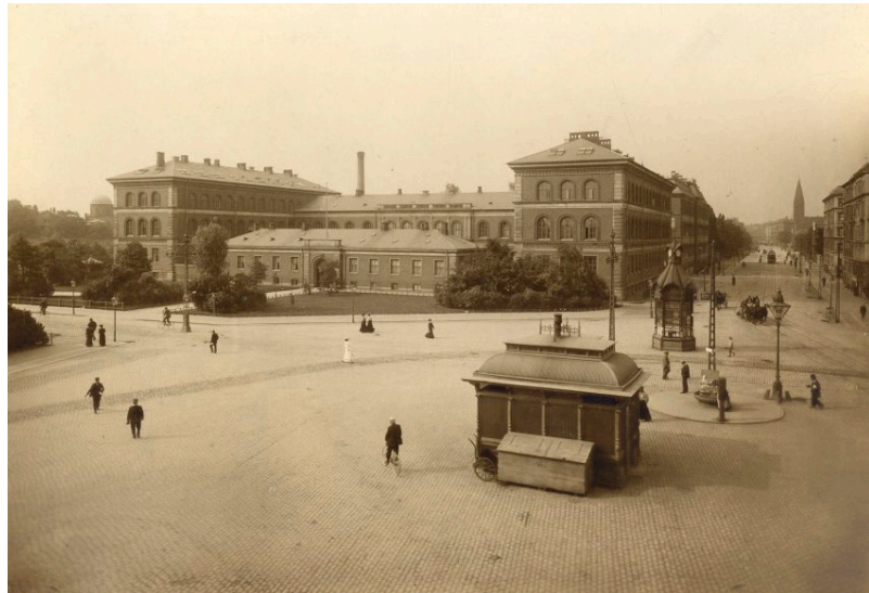
Fig. 1. The Polytechnic School, Copenhagen, ca. 1904–06.