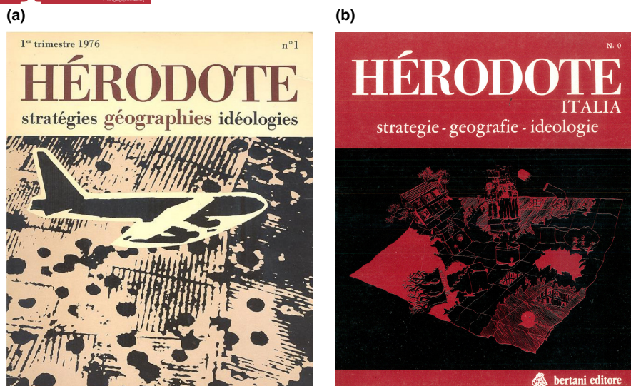
FIGURE 1 Covers of the first issues of the journals Hérodote , published in France since 1976, and Hérodote Italia , published in Italy since 1978.

become—through an apparent paradox—mainstream (Kitchin, 2005), in Italy this never happened, and a purely Marxist geography was more nuanced, and minoritarian, as well as other critical stances.