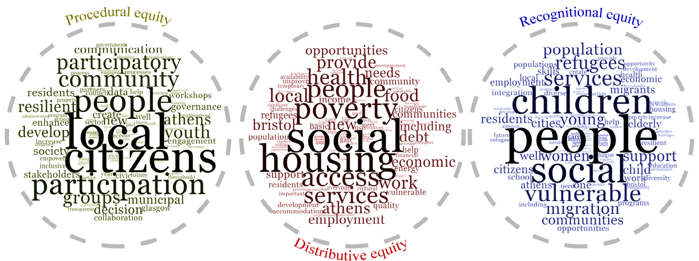
Figure 4. Word cloud of the most emergent themes extracted from the study’s coding effort regarding the three dimensions of equity—elaborated by the authors.