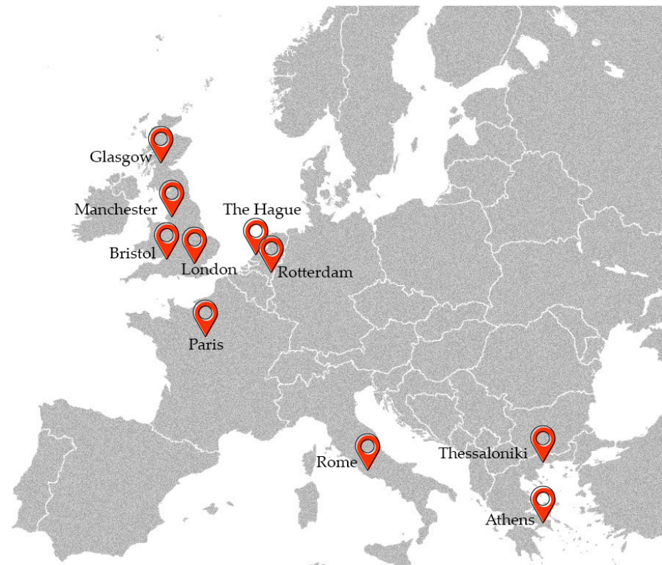
Figure 1. Case studies selected from European member cities of the 100RC or RCN—elaborated by the authors.

Initially—based on the first question—we explore relevant patterns and trends related to the issue of equity within the resilience plans. To clarify, Figure 2 shows the word cloud of the most emergent themes when we analyse the whole content of all ten documents, while Figure 3 shows the most emergent words regarding the social equity issues in the documents.