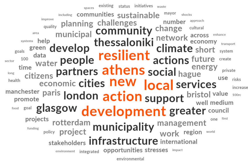
Figure 2. Word cloud of the most emergent themes when analysing the whole content of all ten documents—elaborated by the authors.

Initially—based on the first question—we explore relevant patterns and trends related to the issue of equity within the resilience plans. To clarify, Figure 2 shows the word cloud of the most emergent themes when we analyse the whole content of all ten documents, while Figure 3 shows the most emergent words regarding the social equity issues in the documents.