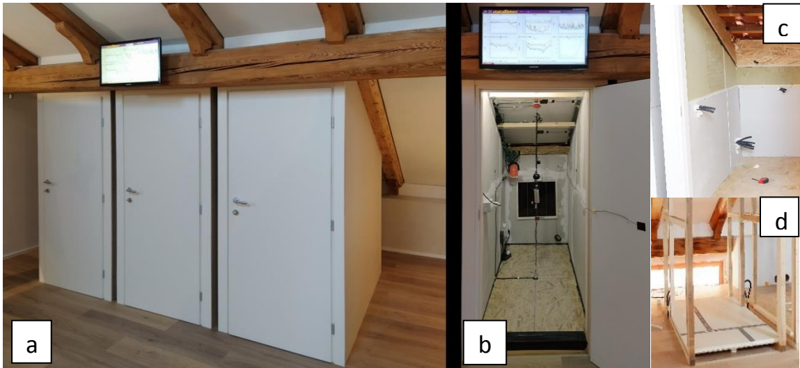
Fig. 1 a) The three test rooms; b) Internal view and sensors position; c) Construction of walls d) Construction of floors