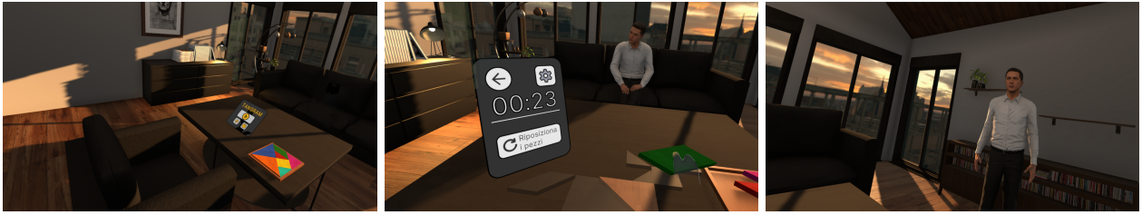
Fig. 1: Overview of the virtual environment during the three game modes. During Neutral Mode , players complete the Tangram puzzles by themselves in the room, without NPC ( left ). During Support Mode , the NPC sits on the couch in front of the player, giving advice, motivation and support ( center ). In Interference Mode the NPC impatiently moves in the room, discouraging and bothering the player ( right ).