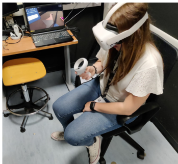
Fig. 3: The experimental setup: Meta Quest 2 headset and Meta Touch controllers.

The experimental sessions took place at the premises of Istituto Italiano di Tecnologia (IIT). The experimental setup included a Meta Quest 2 headset and Meta Touch controllers, connected via cable to a Predator Triton 300 laptop with NVIDIA GeForce RTX 2070 graphics card and Windows 11. (Fig. 3).