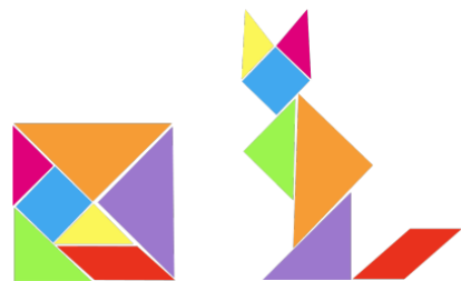
Fig. 2: The seven pieces used in Tangram VR: arranged to form the initial square ( left ) and arranged to form the shape of a fox ( right ).

Tangram is a puzzle game wherein the player is provided with a set number of pieces of different shapes. The objective is to place all the provided pieces properly to form a specific pattern. The Tangram game provides a logic challenge that requires logical thinking, reasoning, and problem-solving skills. It promotes cognitive effort and focus; thus, it is particularly appropriate as an exercise for cognitive rehabilitation. Moreover, manipulating tiles on the board requires precise movements of the upper limbs to properly attach the pieces, training both the accuracy and strength of the utilized arm. These characteristics make the Tangram game well-suited as a combined cognitive and motor rehabilitation exercise in PwMS, effectively addressing the diverse symptoms associated with the condition. In fact, Tangram has been previously employed in the context of MS rehabilitation [10]. For our experiment, a VR implementation of the Tangram game was developed using the Unity game engine (version 2021.3.15). In Tangram VR, there are seven tiles of different geometric shapes: a square, a parallelogram, two small triangles, a medium triangle, and two large triangles, which can form a total of 30 solvable patterns, all inspired by animals (Fig. 2).