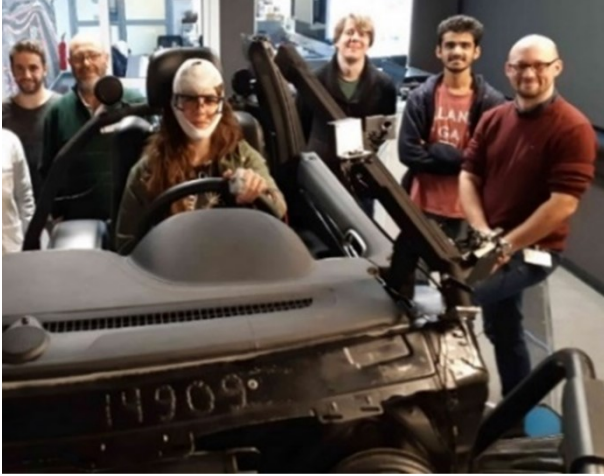
Fig. 2. AVL dynamic simulator, Graz (AT).

collected exploiting a Garmin smartwatch. The output about the driver's condition was generated according to the reduced Karolinska Sleepiness Scale (rKKS) and was constituted of five stages: Calibration, Awake, Low Drowsiness level, Medium Drowsiness level, High Drowsiness level. [13] The algorithm worked in real-time, so processed the collected variables as overlapping windows of n samples. The window size has been selected by the observation of medical doctor. The medical doctor found that, by monitoring certain time periods of cardio-respiratory parameters, it is possible to identify specific levels of sleepiness. The real-time algorithm run as shown in the Pseudo-code 1.