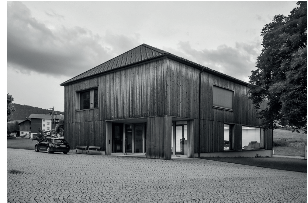
Pfarrhaus, Krumbach, Vorarlberg, Bernardo Bader, 2014

derstood that wooden construction is strongly linked to a specific region's environmental, cultural, political and economic issues. Therefore, the geographical definition of the Alps represents a challenge since the borders are variable, for reasons of an economic, cultural and social nature, but also of a geological and climatic nature. Werner Bätzing states that this variety of factors implies no static and immutable definition of the Alps (Bätzing, 1987). Therefore, every study, whether of an architectural, social or economic nature, must start from analyses and interpretations based on regions to relate the object of research with a space, a society and an economic and cultural system. Speaking of wooden buildings, going beyond the national border within a changing geographical perimeter is essential. For this reason, the thesis takes its first steps within an emblematic region and subject of considerable interest on the part of architectural criticism: Vorarlberg. In recent decades, this region has continuously developed new methods of processing and exploiting wood, creating a whole chain of value creation that ranges from forest management and wood processing to contemporary building culture (Hofmeister, 2019).