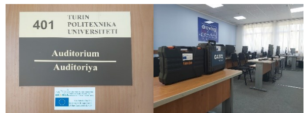
Figure 4. ERAMCA Laboratories in Tajikistan and Uzbekistan