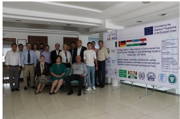
Figure 1. Participants in the Strategic Forum of the ERAMCA project (Tashkent, September 2020)

During a workshop, the invited experts presented the current situation in respective Countries regarding risk assessment and mitigation. They pointed out the need for a new generation of technicians (engineers and architects) to work in a multidisciplinary context by merging different expertise.