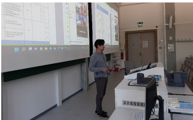
Figure 5. Practical (above) and theoretical (below) sessions of the training week.

As usual for ERASMUS+ initiatives, having a joint meeting between European and non-European teachers is a great possibility to have a fruitful cultural exchange of experiences and a possibility to understand how European approaches can be articulated and adapted in the context of different cultures and traditions.