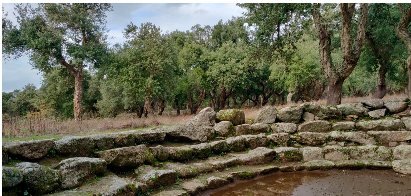
Figure 2. Cork oak forest landscape in Goceano: Sos Nibberos Protected Area, Monte Pisanu.

Cork oak forests represent one of the best examples of the close relationship between man and nature: forests with a high conservation value alternate with agricultural land, integrating extensive agriculture, forest grazing, hunting, and other recreational uses. In Sardinia, cork oak forests are traditionally multifunctional: they are agroforestry systems in which forest exploitation is almost always associated with grazing and agriculture. The relative weight of each component—forest, agriculture, and animal production—in the overall economic return of the system has changed over time. Recently, agriculture has been responsible for the opening up of large areas of forests, and cultivation in cork oak stands has been carried out extensively during the last century. Livestock, fed on natural vegetation and acorns or improved pastures, has been and still is one of the important products supported by cork oak stands. Other uses of cork oak forests are based on their rich biodiversity: mushroom picking, bee-keeping, and aromatic plants.