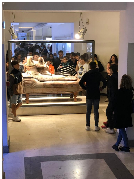
Figure 4: Etruscan Museum of Villa Giulia, Roma 2022: being “ecological”; experiments sometimes had to deal with noticeable disturbing elements, such as visits from classes of young and (noisy) students.