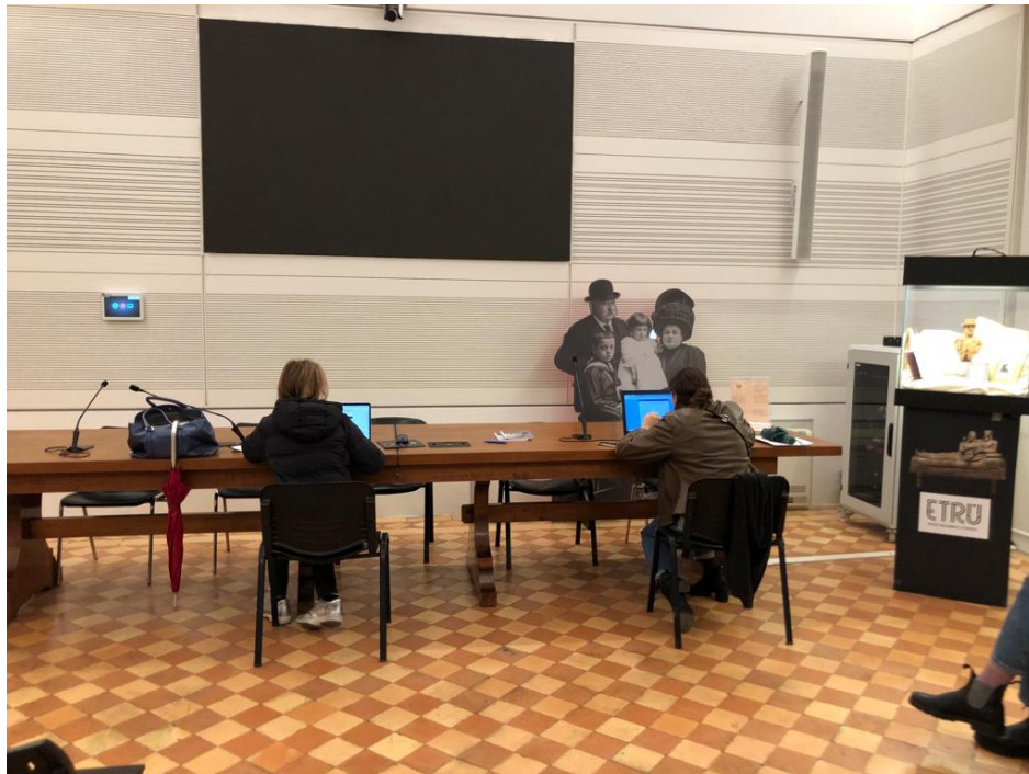
Figure 2: Etruscan Museum of Villa Giulia, Roma 2022: participants in the experiment were asked, after the visit, to fill in a second questionnaire.