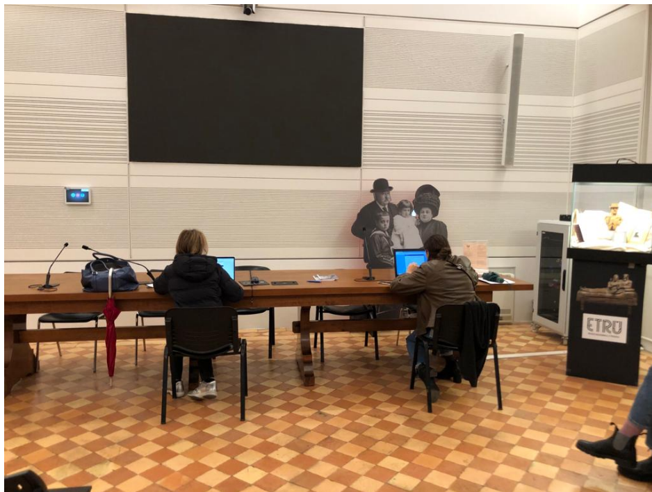
Figure 2: Etruscan Museum of Villa Giulia, Roma 2022: participants in the experiment were asked, after the visit, to fill in a second questionnaire.