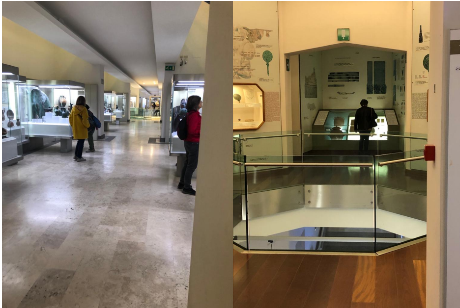
Figure 3: Etruscan Museum of Villa Giulia, Roma 2022: participants in the experiment were invited to “normally” visit the museum, equipped with wearable devices.