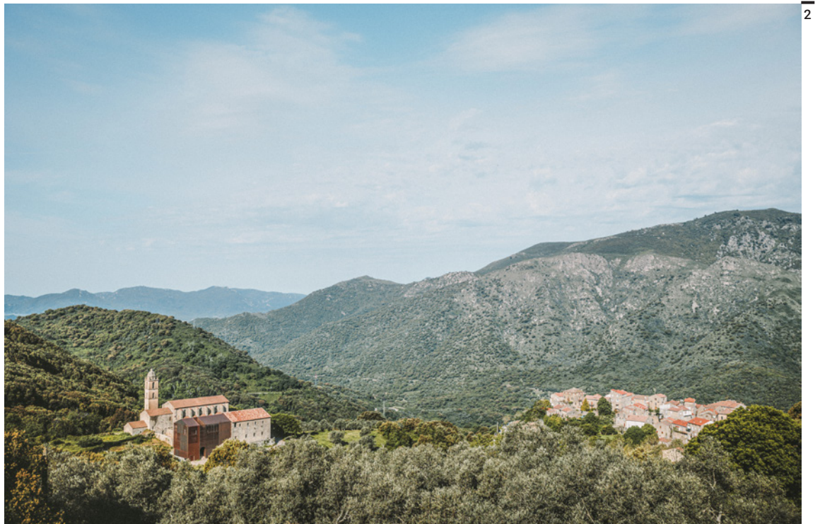
Fig. 4 View of the portico.