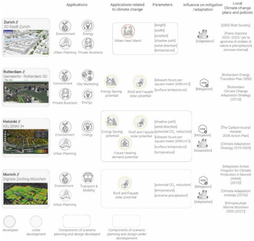
Fig. 55.2 Analysis of urban digital twin to support climate change scenario planning and design.

In the future, UDT could be the right platform to collect, elaborate, and visualize the results of the combination of different indicators to assess the possible mitigation and adaptation design measures could be implemented for buildings and open air spaces regeneration. This perspective required more studies in order to choose design measures and relative indicators, adequate parametric digital tools to simulate each indicator, right aggregation of different indicators, and rules to make results interoperable with UDT.