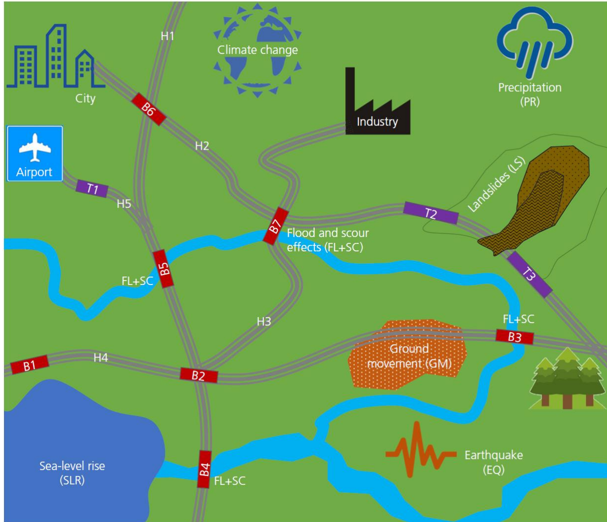
Figure 3. Interconnected transport assets (highway, bridges, tunnels) in multi-hazard conditions (Argyroudis 2022).

The last two contributions focus on two significant case studies. Godazgar et al. (2022) provided a probabilistic resilience curve for the Chemin des Dalles Bridge (CDB) in Quebec, Canada. This model incorporates fragility and restoration profiles available in the literature. In the last paper, Langley (2022) provides the background to the replacement project for the moveable bridge on the A554 Tower Road. The civil, mechanical and electrical designs are described and some of the significant issues encountered during implementation and commissioning are discussed.