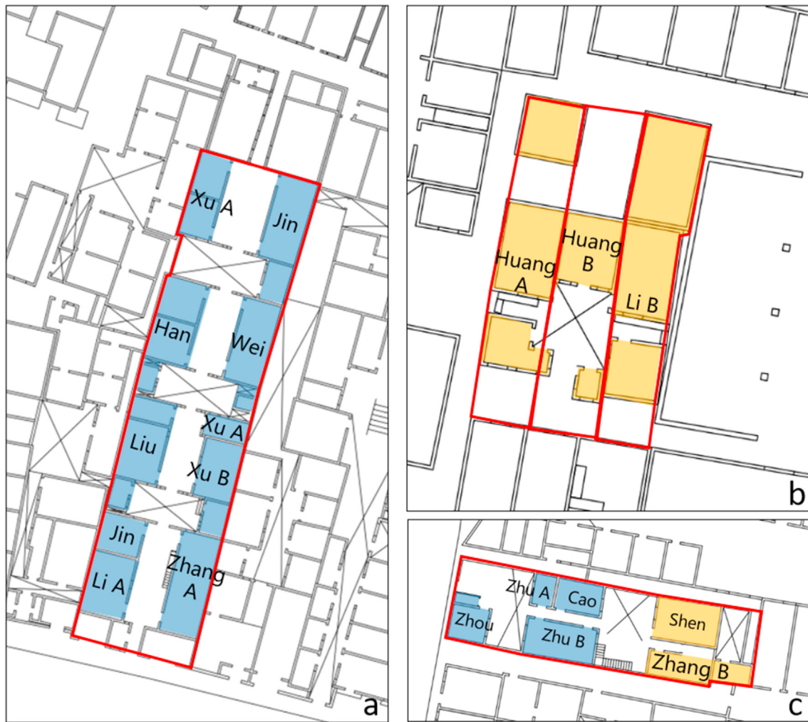
Fig. 1 The relationship between land property and housing property in historic areas: (a) Public housing—multiple public housing tenants in the same property rights plot; (b) Private housing—the land and house have been subdivided due to inheritance; (c) A mix of public and private—public housing and private housing coexist in the same property rights plot (source: the authors).

more than 1,300 building units of the Xiaoxihu area, drew typological map of the entire area, and then overlaid the property rights information on it through detailed property surveys and residents' interviews. Fig. 2 shows one part of the new map with property rights, called "property typological map". On the base map of walls, columns, doors, windows, etc. drawn by black lines, we used red solid lines to outline the boundary of the land property rights, and marked the name of each house property owner in the corresponding rooms (indicated with letters in the figure). The new property typological map more clearly shows the boundaries of the property rights plots, and their internal building layout and housing property rights distribution. The map also became the co-working base map for communication between the research team, the implementation team, and the residents.