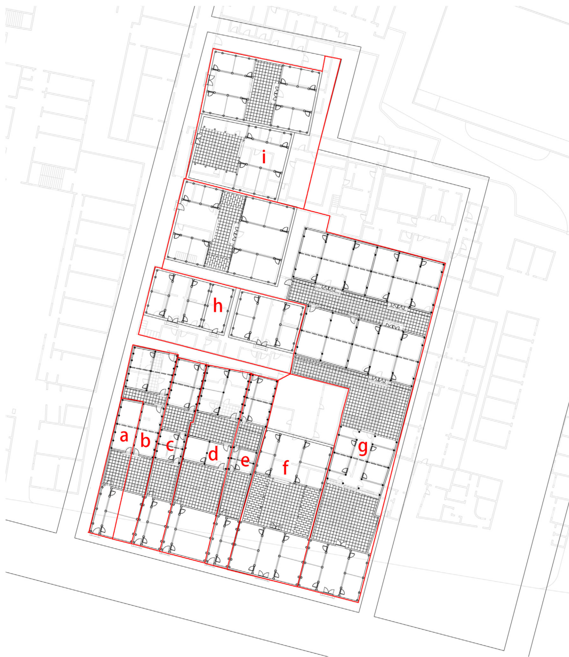
Fig. 4 Part of speculative typological map of Xiaoxihu area.

B2, C1, and C2, and focused on a comparative study in the two dimensions of diachrony and synchrony based on the “space-property-function” maps and justified graphs in 1930’ and 2016 (Table 2).