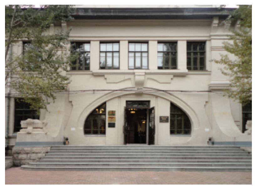
Fig. 2 Harbin (China). Architectural and Civil-Engineering Institute (1920). Facade.

In Czernovitz the major role played by the German-speaking community, within the multiplicity of social components, created a homogeneous architectural landscape, with 'some' national spots, visible but not prominent. The model was Vienna: the Herrengasse, the street with the most elegant cafés and the most important shops, looked to the Viennese Graben. Building in Secession and Eclectic styles made the urban fabric totally Western, European and Viennese. The town had particular look also because it was very new – there wasn't a Gothic, Renaissance or Baroque historical core. Despite the first appearance of the name of the place in a record dated 1408, the place officially became a city in 1786, and grew especially in the second half of the nineteenth and the beginning of twentieth century. Everything in Czernowitz played a role in this Viennese festival: street names, the building typology, the retail system, the new railway station (built in 1905 in Secession style by Moritz Elling), the Volksgarten (close to the area where the officer of the Austrian administration and the wealthy German families lived in villas). The most Austrian elements were absolutely the Theatre and the Postal Saving Bank. The former was built in 1905 in a Neo-Baroque/Secession style by Fellner & Hellmer, well-known theatre designers operating in the whole empire between 1871 and 1913; it was a copy of the theatre already built in Fürt (1902), and then was a reference for the following one in