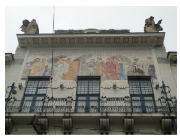
Fig. 3 . Cernowitz (Ukraine). Postparkasse, today Art Museum (Hubert Gessner, 1900). Facade.

Jewish – modernised bourgeoisie of the city, such as the shopping arcade Matildenhof (1904) and the Goldene Dirne (1905).<sup>18</sup>