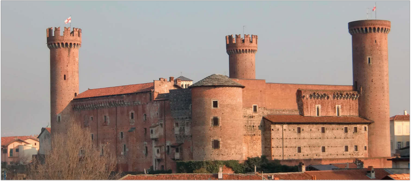
fig. 1 – Ivrea. Castello “delle quattro torri”, prospetto nord-ovest (foto dell’autore).

con le quattro torri a pianta circolare e una serie di aperture a monofora e bifora ancora ben conservate (fig. 1).