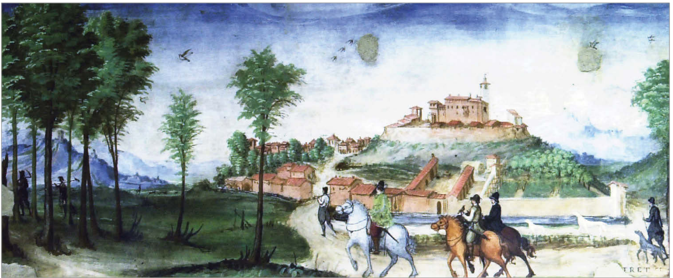
fig. 2 – Foglizzo. Castello, prospetto ovest.