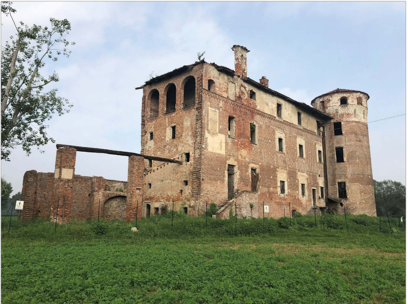
fig. I – Parpaglia, Candiolo. Castello, prospetto est.