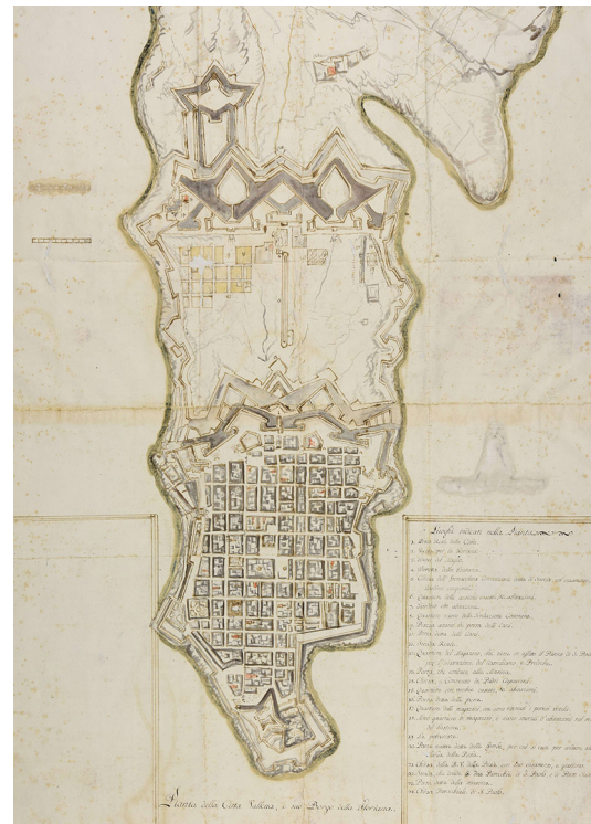
Pianta della Città Valletta, e suo Borgo della Floriana. (Cathedral Museum, Mdina. Inventory number, 1122. HMML Project Number CMUS 00490)

Cultural heritage organizations, whether archives, libraries, or museums, increasingly lack the financial resources and necessary staff to maintain their collections due to diminishing financial support. To support these collections, the Malta Study Center will focus on three main projects in addition to the project in Italy. At the National Archives of Malta, we will digitize the prize courts of the Order of Saint John and related maritime tribunal records. These tribunals chart the history of corsair, trade, and maritime activity of early modern Malta and the Mediterranean. Last year we began the monumental digitization of the Archives of the Order of Malta and manuscript collections in the National Library of Malta. This decade-long digitization project will include over 10,000 works when complete. The Center is also in the fifth year of its eight-year France and Malta in the Age of Revolution Project, 1775-1815 project, which focuses on the important but neglected archives and collections pertaining to the crucial period of revolutionary history for the Americas, Europe, and Mediterranean. We hope to continue this project at the Museum of the Order of Saint John in London next year with plans to begin work in France in 2024 or 2025. Much is being done, but more is yet to be done to preserve these essential records of Italian, Mediterranean, and Maltese history.