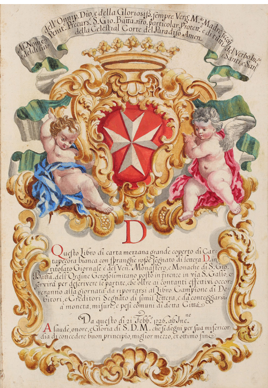
Coat of Arms of the Order of Malta and two putti, illuminated drawing on paper.

Many archives in Malta preserve drawings about fortifications, property, and buildings. These drawings were created as part of land surveys ( cabrei ) commissioned by the Order of Saint John or by other institutions to manage or improve their properties. Secular and ecclesiastical tribunals frequently preserved architectural drawings as part of legal disputes brought before the courts. There is also an extensive history of fortifications in Malta, especially in the archives related to the Congregazione de guerra of the Order of Saint John at the National Library of Malta and National Archives of Malta. The Malta Study Center also has digitized over 3000 pre-1815 drawings and prints in Maltese collections. These include some 636 rare and unstudied Renaissance and Baroque drawings from the Cathedral Museum in Mdina, 192 prints and drawings from the Malta Maritime Museum, and over 1000 prints and drawings from MUŻA-Mużew Nazzjonali tal-Arti. Smaller art collections from other archives and museums have also been digitized by the Center. Of particular interest are the seventeenth- and eighteenth-century drawings, especially those of Elisabetta Sirani, Mattia Preti, and Antione de Favray, as well as the over 400 maps from the Albert Ganado Malta Map Collection at MUŻA.