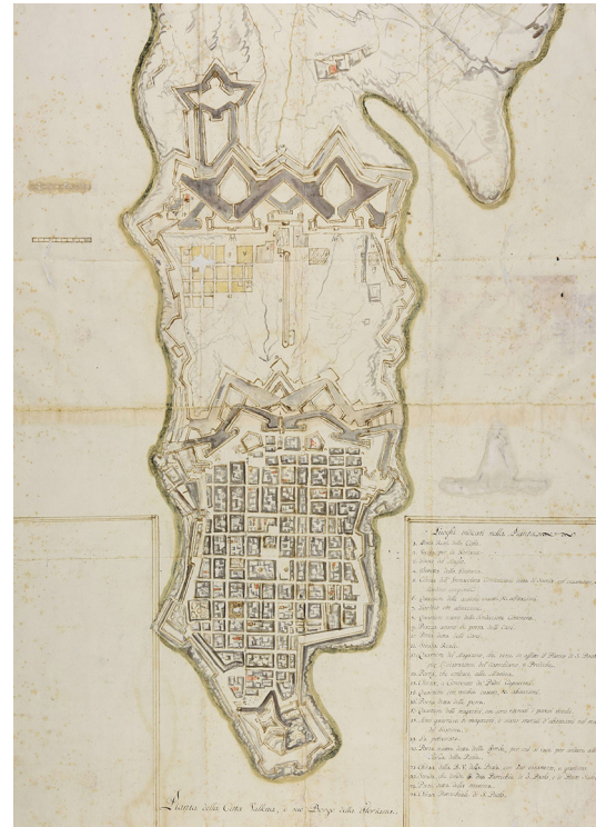
Pianta della Città Valletta, e suo Borgo della Floriana. (Cathedral Museum, Mdina. Inventory number, 1122. HMML Project Number CMUS 00490)

Cultural heritage organizations, whether archives, libraries, or museums, increasingly lack the financial resources and necessary staff to maintain their collections due to diminishing financial support. To support these collections, the Malta Study Center will focus on three main projects in addition to the project in Italy. At the National Archives of Malta, we will digitize the prize courts of the Order of Saint John and related maritime tribunal records. These tribunals chart the history of corsair, trade, and maritime activity of early modern Malta and the Mediterranean. Last year we began the monumental digitization of the Archives of the Order of Malta and manuscript collections in the National Library of Malta. This decade-long digitization project will include over 10,000 works when complete. The Center is also in the fifth year of its eight-year France and Malta in the Age of Revolution Project, 1775-1815 project, which focuses on the important but neglected archives and collections pertaining to the crucial period of revolutionary history for the Americas, Europe, and Mediterranean. We hope to continue this project at the Museum of the Order of Saint John in London next year with plans to begin work in France in 2024 or 2025. Much is being done, but more is yet to be done to preserve these essential records of Italian, Mediterranean, and Maltese history.