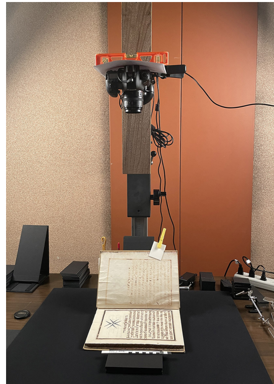
Malta Study Center Studio at the Archivio di Stato di Firenze, October 2022