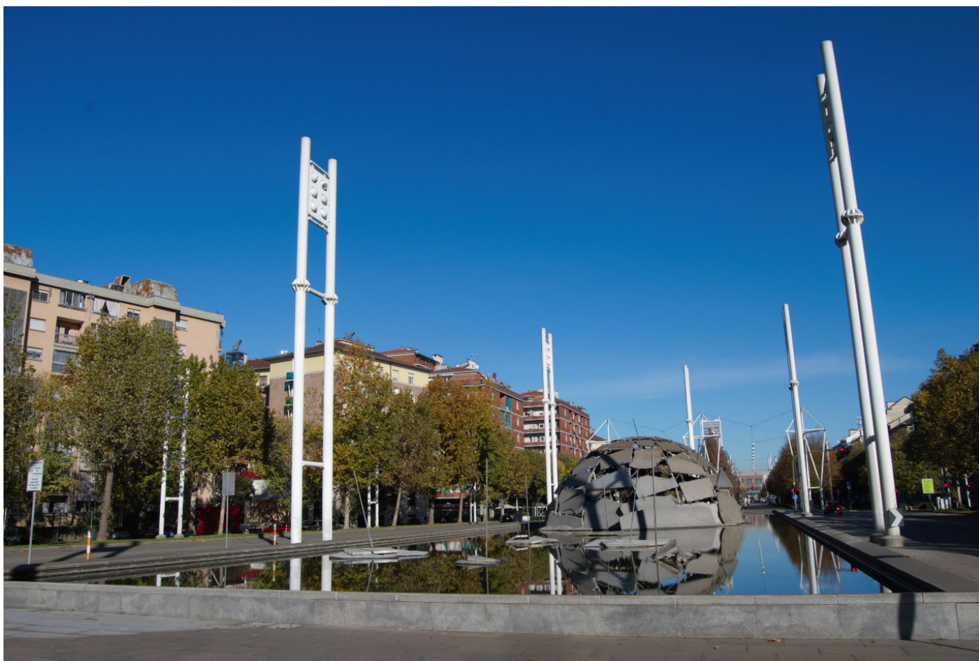
Fig. 1: Spina Centrale , the Mario Merz's Igloo

The article aims to propose a critical reading of Turin's recent urban events, not only through a necessarily synthetic interpretation of the urban policies that have marked the last thirty years, but also by highlighting some 'missed acts' that explain, at least in part, the current difficulties to face an arduous and never ending post-industrial transition. The discussion starts from the 2006 Winter Olympics, and then describes the difficulties of the urban transition towards the so-called knowledge economy. By focusing on the Turin's attempt to go beyond the so-called "Fordist urban model", and highlighting the present weakness of the socio-economic urban fabric, we advance two main arguments. The first one is that the never ending search for a new urban development model is marked by shortcuts and illusions, that led to the disapper of a fresh