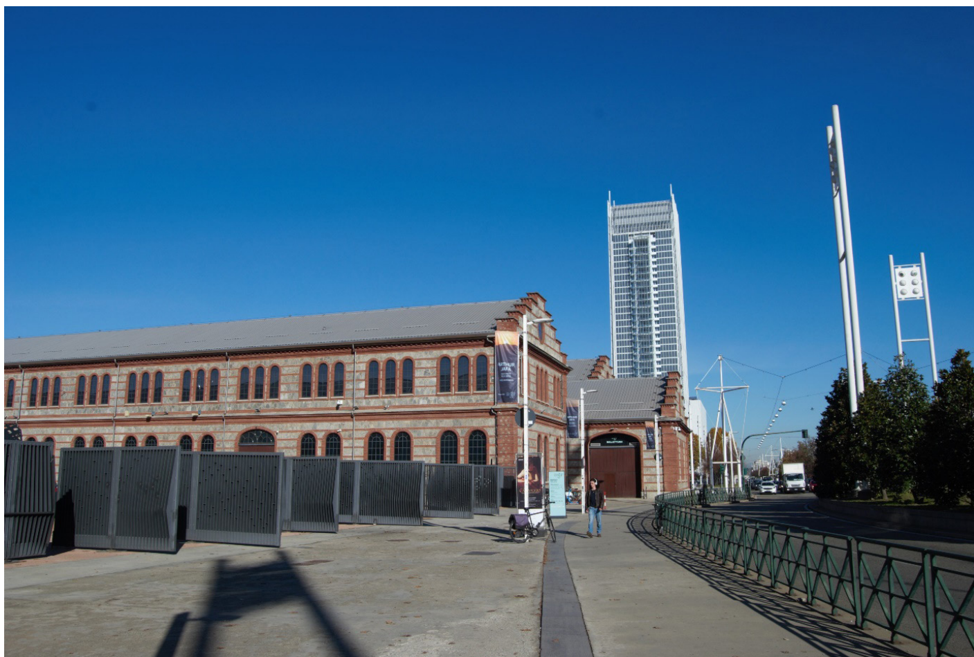
Fig. 3: Spina Centrale : the restored OGR and the Renzo Piano's Intesa San Paolo Bank skyscraper

available ISTAT survey (2018), there are 222.577 businesses within the territory of the Metropolitan City of Turin, of which about 1/3 are tertiary (Camera di Commercio di Torino, 2022). Among the latter, however, only a minority can be counted under the category of the innovative enterprise (Caviggioli, Neirotti and Scellato, 2018; Rota Report, 2018).