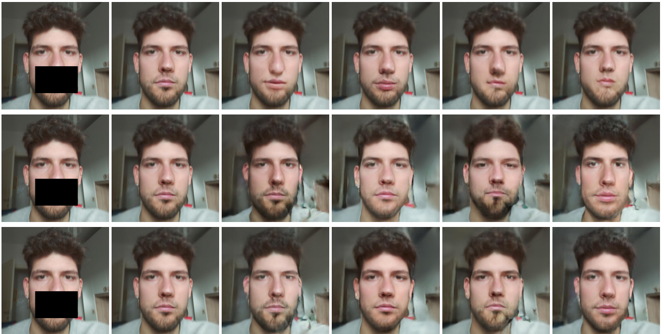
Fig. 3: Top row: solutions found by PULSE ( \ell_2 range: [1.3 \times 10^{-4}, 1.5 \times 10^{-4}] ). Mid row: solutions found by using \mathbf{v}^8 and \mathbf{v}^{26} as directions ( \ell_2 range: [3.9 \times 10^{-3}, 4.7 \times 10^{-3}] ). Bottom row: solutions found by optimized \mathbf{d} as direction ( \ell_2 range: [1.2 \times 10^{-3}, 2 \times 10^{-3}] ).