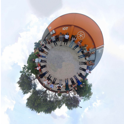
Fig. 2. Panoramic photo with participants of the UID PhD Summer School 2022.

Solutions / La comunicazione e valorizzazione del Patrimonio Culturale mediante l'utilizzo di soluzioni open e web-based.