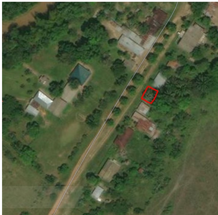
FIGURE 2. Hamlet of Sabanas de La Fuga. Photo from Apple maps, 2021