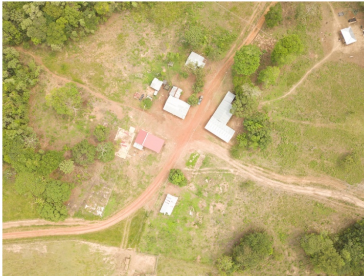
FIGURE 1. Hamlet of Charrasquera.

conditions in the enclosures and finishes. The community decided to keep it and build the new one in the adjacent lot, with the vision of integrating them and improving the existing infrastructure.