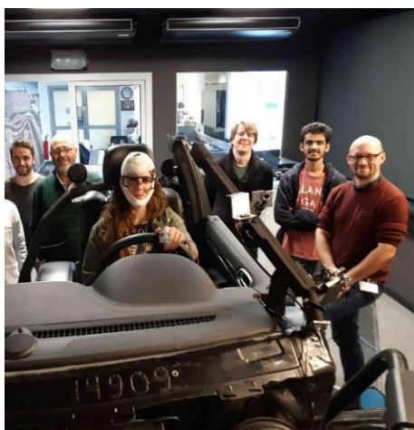
Fig. 1. AVL driver simulator, Graz(AT) [19]