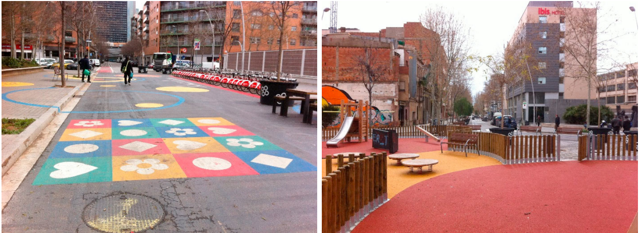
Fig. 2. The SM in Poblenou. Left: temporary intervention; right: structural intervention.