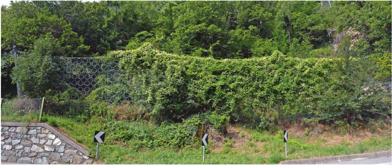
Fig. 6 – Presence of dense vegetation.

conditions, even human-driven, can reduce the expected working life significantly. Consequently, a quick-assessment procedure to evaluate the state of conservation and to define the need of maintenance can provide a profitable solution to manage and plan the maintenance, especially for Authorities who have to administer a huge territory.