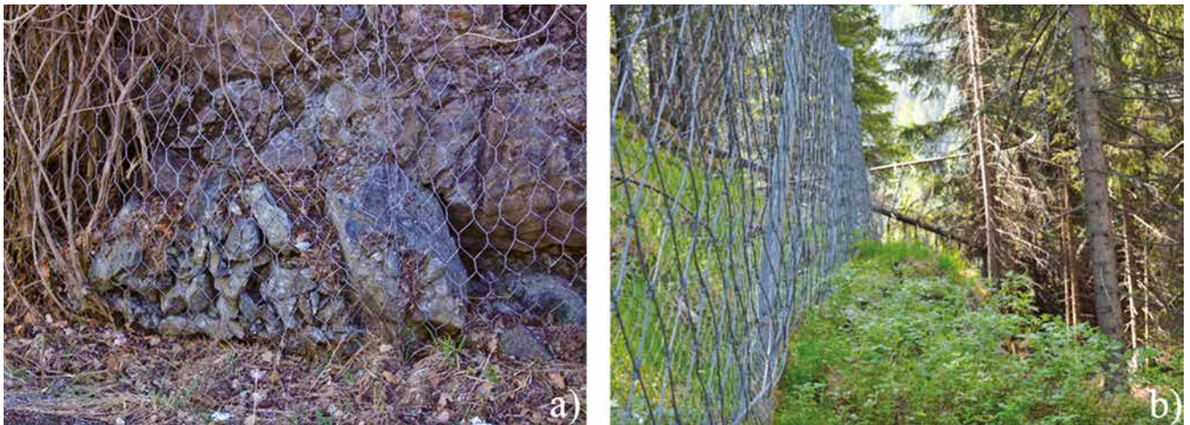
Fig. 2 – Accumulation of debris, due also to impacts with energy smaller than the design one (a), and impacts of element differing from rock blocks, i.e. trees after some severe or unexpected climatic events (b).

climatic events, represent recurring situations highlighted during inspections (Fig. 2).