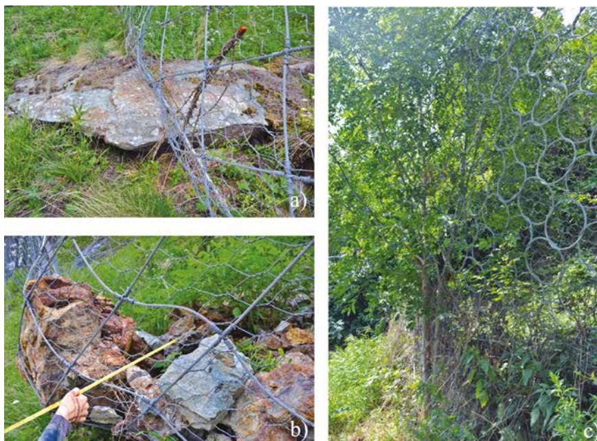
Fig. 4 – Frequent observed damages: voids at the foot of the barrier (a), debris/blocks/notches in the net (b), and elements limiting the deformation capacity of the barrier (c).

Of course, defining a precise timing for the intervention is difficult to achieve and the periodic inspections could be followed, in case of urgent or medium-high need of maintenance, by integrity inspections to properly evaluate the requested interventions and procedures. Integrity inspections could be also planned for medium need of maintenance or after a predefined number of periodic inspection, e.g. 3 times.