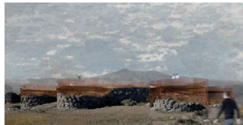
Fig. 5. Team 1, proposal for catwalks over the top

In this section, we present four design hypotheses that were explored during the workshop. We believe they encompass and represent the methodological assumptions we brought to light. The first project concentrated all the service functions in a single structure, located east of the archaeological park. In this way, the building acts as a hinge between the inhabited area and the archaeological artifact in the longitudinal sense. At the same time, transversally, it looks at the landscape of Monte Arci, a legacy of the Neolithic past, and underlines the presence of the Su Parigheddu grove along which lies the Nuragic village. Although very characterized and formally autonomous, the design action has the advantage of incorporating the territorial and historical symbolic dimensions, undoubtedly one of the core objectives of the project. These proposed actions on the nuraghe are expressed in the definition of a new, utterly artificial accessibility plan, corresponding roughly to the horizontal section at the altitude just above the maximum height of the ruins. This expedient confers more legibility to the monument and renders it a significant tourist attraction.