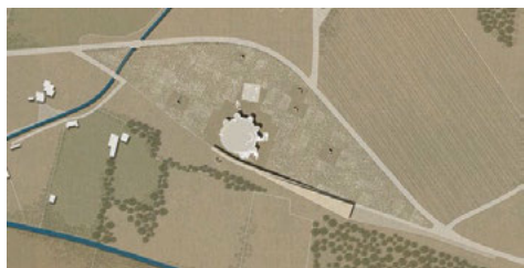
Fig. 6. Team 2, the museum and the catwalk touching the nuraghe

In the third proposal, the solution to the space of the archaeological park is not obtained through the service building. On the contrary, the proposal favors a less volumetric approach based on a simple concentric path with a direct relationship with the nuraghe. This becomes the center of the composition and of the narrative path that develops around it. However, the external area is not "other" but is somehow included as an additional element of the relationship. The fourth proposal is perhaps the most axiomatic of the projects and the one that stands out for its remarkable originality and balance. As in the previous proposal, the museum building is absent; in addition, the supporting buildings are completely ancillary, playing a secondary service role to facilitate a "pause" or orientation in the development of the spatial sequence. Although based on a similar principle as the third project, this fourth proposal makes the geographical relationship between the nuraghe and its surroundings even clearer. In this case, the circular path is not used to access the ruin but as a device for interpreting landscape relations, thus assuming a more profound and sophisticated value.