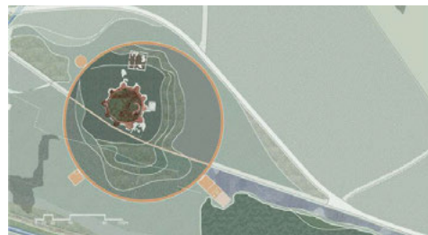
Fig. 8. Team 3, landscape design solution