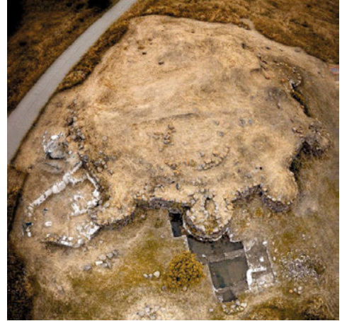
Fig. 4. The nuraghe from above

when the nuraghe was already in partial ruin. The road crosses over part of the perimeter defensive wall and covers at least two towers.