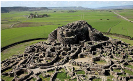
Fig. 1. Aerial view of the so-called Reggia di Barumini

a system of rules, opportunities, and actions that strengthen the link between the asset to be protected and the community that hosts it. The recent establishment of the "Mont'e Prama Foundation," namesake of the site where the famous statues of the "Giants of Mont'e Prama" were found, will have to deal with constructing the system of the archaeological areas of the Sinis Peninsula and the Campidano di Milis. This foundation constitutes an important novelty in public initiative, working in conjunction with other projects stewarded by the University of Cagliari to support the enhancement, musealisation, and accessibility of these areas. This interest, however, which includes territorial promotion initiatives, risks being thwarted by the enormous dispersion of public funding lines and by the fragmentation of decision-making centers. The thirty-one Nuragic sites registered in the World Heritage Site, certainly among the most emblematic, best preserved and legible, constitute an infinitesimal percentage of the remnants of the ancient Sardinian civilization of the Bronze Age.