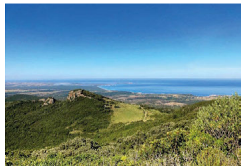
Fig. 2. View from the top of the Montiferru mountain to the Sinis Peninsula

San Vero Milis' S'Urachi is arguably one of the most critical sites in the area. It is one of the largest "complex-nuraghe" in Sardinia, and at its cultural peak was among the most relevant megalithic constructions in the western Mediterranean. The large basalt tower, originally over twenty-five meters high of which only the five-meter base remains, was surrounded by a long defensive stone wall and a relatively-rare deep moat. Its highly unusual territorial location in the lowland expresses the importance of claiming the political, military, and symbolic possession of that specific node in commercial relations as well as its strategic location along the exchange routes between the hinterland (the Monti Ferru , rich in ores) and the sea, through the ports of the Sinis peninsula. In fact, the building is among the longest-lived in terms of use, so the Phoenician and even Roman ruins are evident. Today, s'Urachi is the symbol of the Campidano di Milis community and the small town of San Vero, which was built using S'Urachi as a quarry for building material. The site, therefore, expresses an extraordinary historical and geographical depth that can be suitably leveraged (also in service of the nearby UNESCO sites), working in particular on its role as a reading device of the complex territorial relations of which it was, with all evidence, the epicenter.