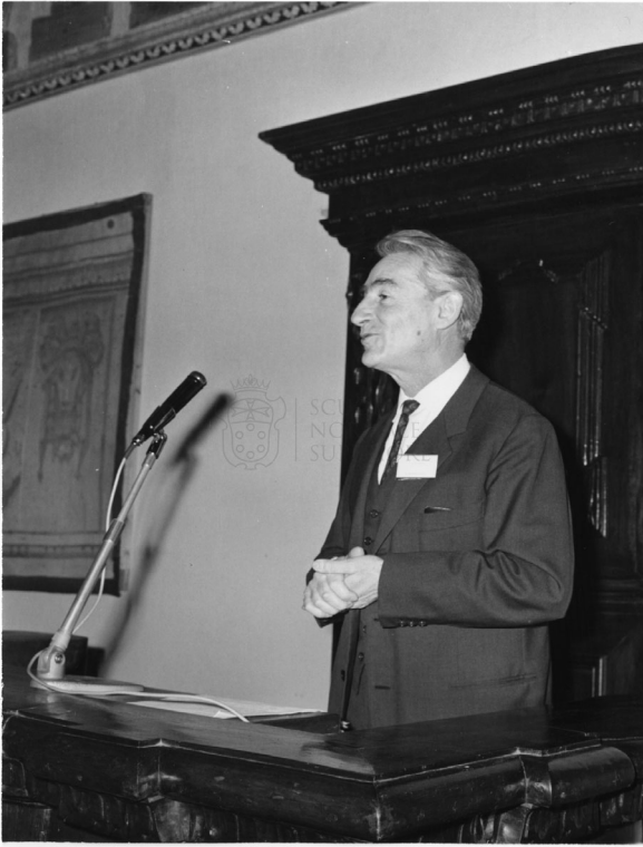
FIGURE 1 Gilberto Bernardini addresses the audience at the Pisa meeting in April 1966, Raccolta fotografica Scuola Normale Superiore, Meeting, Meeting on European Collaboration in Physics 16-17 Aprile 1966, Centro Archivistico della Scuola Normale Superiore, Pisa, Italy