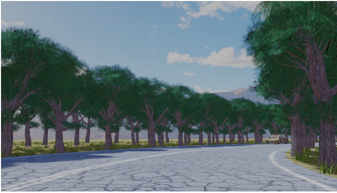
Fig. 1. A screenshot of one of the scenarios set in the suburban setting used to calibrate the driving algorithm based on passengers' reaction.

better attitude towards them, but some resistance to their introduction remains [8].