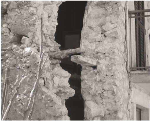
Figure 3. Villa S. Angelo (AQ), wooden radiciamenti placed in the thickness of corner walls.

(Figure 4). Their position is always dependent on that of doors and windows to ensure a continuous hooping system. It is not uncommon to find them associated with vaulted structures at the height of the haunch to counteract the horizontal thrusts.