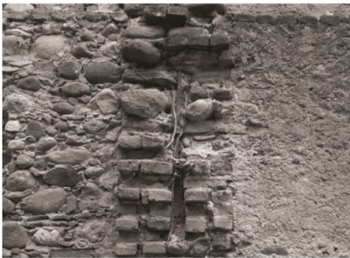
Figure 10. Montalenghe (TO), metal anchor recessed in the masonry tothing revealing the presence of a metal tie-rod in the half-width of the back transverse wall.

The presence of the INA-casa specifications defined as radiciamenti , the reinforced concrete ring beams resting on load-bearing masonry walls and supporting the joist slabs with hollow tiles, in the 1900s provides evidence of the prevalence of a construction practice that, tackling the root of masonry building issues (which can be summarized in the inherent weakness of connections), had become the most effective response to earthquake activity, (Barelli 2020). Despite the material (timber, iron or reinforced concrete), it is evident that the function was (correctly) believed to be the same.