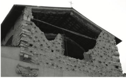
Figure 2. L'Aquila, chiesa di S. Giuseppe Artigiano, the metal anchors located in the corner walls connect the wooden 'radici-amenti'.