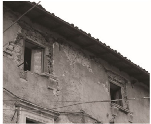
Figure 5. L'Aquila, wooden anchors of the roof trusses.

suggest an even closer proximity to the mid-century codification.