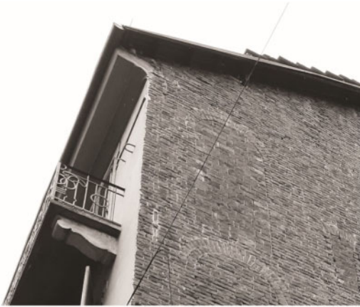
Figure 9. Turin, anchors of façade's metal radiciamenti emerging from recesses housed in the transverse wall.