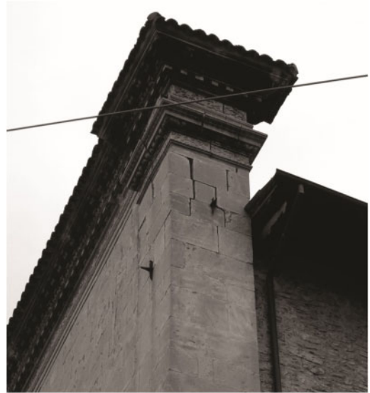
Figure 4. L'Aquila, chiesa di S. Flaviano, metal anchors of façade 'radiciamenti'.

Although not the specific subject of the reflections here presented, it is worth noting that recent studies (Aloisio, Fragiaco & D'Alò 2019) have highlighted further traits which might be included in this construction technique: timber frame walls made of vertical studs – both load-bearing and partition walls but mostly internal – were found and seem to