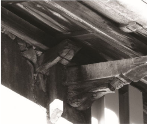
Figure 6. Detail of a wooden anchor connecting the roof trusses to the external wall.

What mainly sets the techniques apart is that the early 18th century technique provides for a simpler – in a sense, more elementary – configuration of the wooden material which is, to our knowledge, limited to the creation of horizontal elements. That appears to relate to these techniques' different aims: the first, essentially a reconstruction technique, appears to be suitable both for the construction ab imis of new buildings and, more frequently, for restoring earthquake-damaged buildings by reusing the remaining structures (usually the lower floors) and connecting them to the new completion. The second, the Bourbon system is,