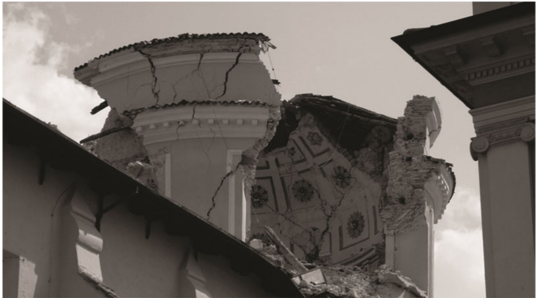
Figure 1. L'Aquila, chiesa delle Anime Sante, three courses of wooden radiciamenti in the drum of the dome.

using different types of infill material. The latter is essentially independent of the timber structure which alone fulfils the entire building's structural function.