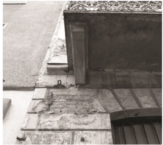
Figure 11. Turin, the closeness to the façade edge of the metal anchor reveals that the corresponding tie-rod is embedded in the orthogonal wall.

The evolutionary process outlined in this report – which from a set of uncodified construction practices (recognised in territorial contexts which differ in building technique and earthquake intensity and frequency) would lead to an expressly anti-seismic normative system – certainly deserve to be investigated in detail.