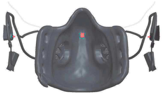
Fig. 2 Three-dimensional rendering of the AG-47 SmartMask with the positions of the main sensors highlighted in red. In the configuration shown, the mask is presented with a replication factor of 1 for the thermo-hygrobarometric (full red square) inside its facial containment cavity and with a replication factor of 2 for the intraural thermal sensors (red cones) and the pulse oximetry sensors for the ear lobe (black pliers)

The so-called “active” action of the filter naturally adds to that of the “passive” type carried out by the non-woven fabric materials of which the common surgical masks are made. The dual “active-passive” functionality with which the filter of the AG-47 SmartMask is equipped is obtained by inserting a layer of a special, suitably spun conductive fabric (active filtering zone) between the two surface layers made of non-woven fabric materials (passive filtering zone). The active function of the mask is ensured by a low voltage power supply which must