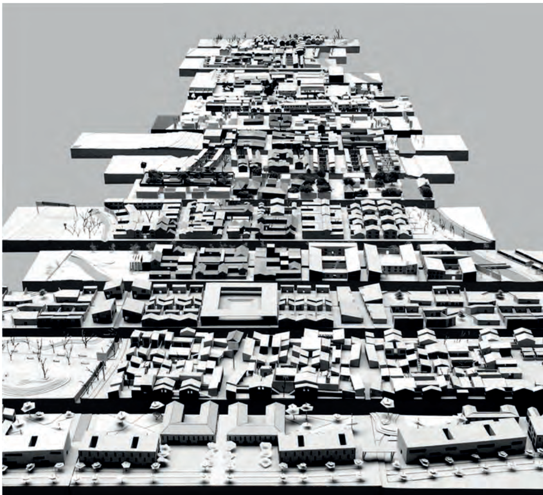
Figure 4. Studies on the Left Street cross section at Nanjing, Pukou.