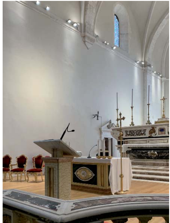
Fig. 12-13. Basilica di Santa Maria di Collemaggio, L'Aquila (Italy), 2019; after the restoration.