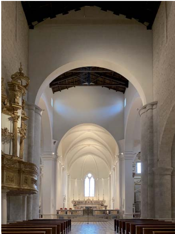
Fig. 14. Basilica di Santa Maria di Collemaggio, L'Aquila (Italy), 2019; after the restoration.

ancient buildings and cultural heritage. The last, and probably the most difficult, topic to investigate is the weight of cultural, cultural and memorial issues on the dynamics of reconstruction and application of liturgical reordering in churches.