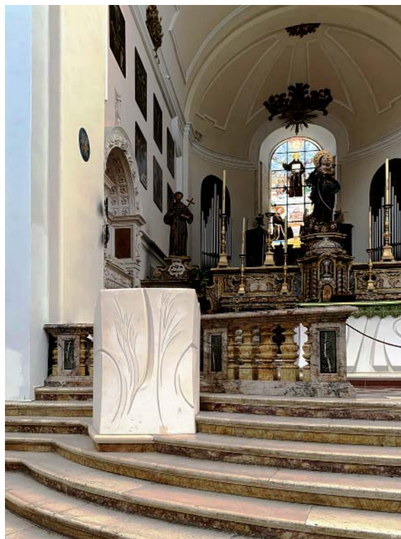
Fig. 10-11. Basilica di San Bernardino, L'Aquila (Italy), 2019; liturgical reordering.