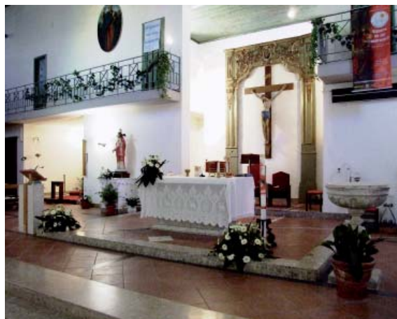
Fig. 05-06. Giorgio Grassi. Chiesa Madre, Teora (Italy), 1981-83/2011.

Nuova Bisaccia there is the Sacro Cuore di Gesù Vita e Risurrezione Nostra church built during the post-earthquake reconstruction process and designed by the architect Aldo Loris Rossi (who was born in Bisaccia). The church is designed according to the liturgical reform but resulted in architectural debates due to its shape configuration.