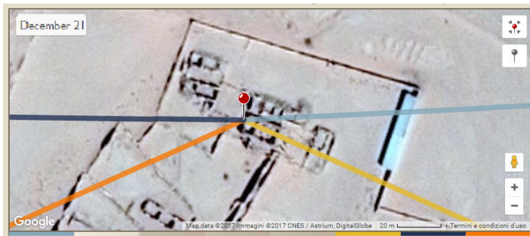
Figure 7: The Photographer's Ephemeris and the northern part of the enclosure on the winter solstice.

Musawwarat [25,26]. Following the analogy, we could imagine Amun as the sun, Arensnuphis as the moon, companion of the sun, and Sebiuameker as the cosmos generating the life. Another link to procreation is the following. In this Enclosure, according to the archaeologist Steffen Wenig, the 'Holy Wedding' was celebrated. It was the union of the king and the queen to create the successor [27]. More or less, the cycle of the moon was lasting as long as the time necessary to grow and educate a new king for the kingdom. Therefore, it is plausible that a reference to the cycle of the moon, besides to that of the sun, was introduced by the architects that re-erected the Great Enclosure in its final form, to emphasize the link between the kingdom and the sky.