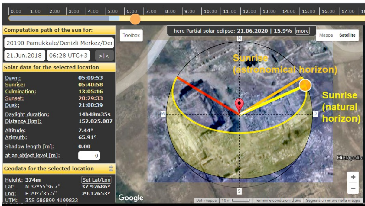
Figure 2. SunCalc.org software screenshot, for the temple of Apollo Lairbenos, on June 21. We can see the directions of sunrise and sunset on the local astronomical horizon and the azimuth of the sun when it has an altitude of 7.44 degrees. This is also the direction of the sunrise according to the natural horizon.