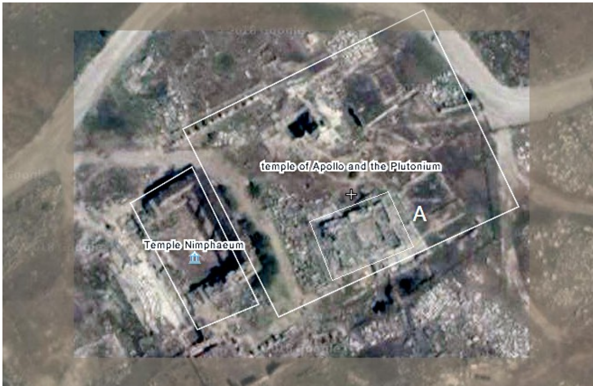
Figure 1. The temenos of the temple of Apollo Lairbenos in Hierapolis and the Nymphaeum, as given in Wikimapia. Site A indicates the temple as considered in Ref.7.