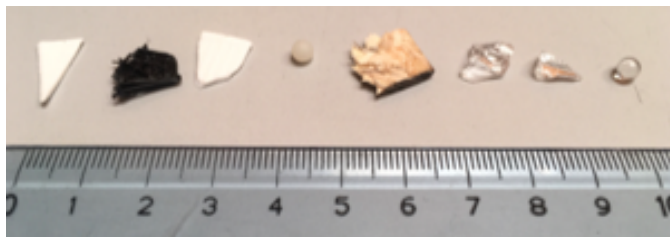
Fig. 2. A picture of the contaminants used for testing, and a ruler as a dimensions reference.

The MW sensing system is shown in Fig. 1; an arch-shaped 3-D printed support is holding the antennas in a fixed position around the target. Their number and position have been evaluated considering the degrees of freedom theory [6]