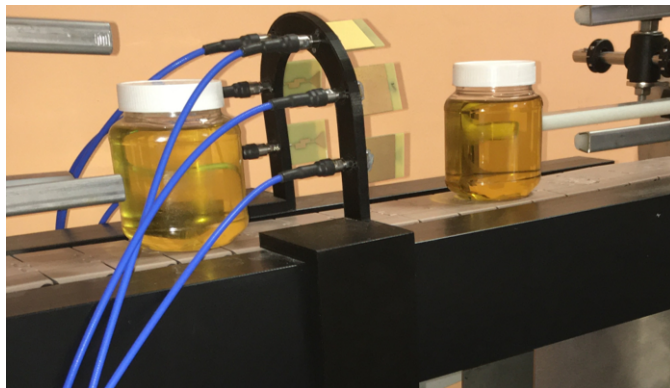
Fig. 1. An overview of the sensing system: two jars passing through the arch support holding the PCB antennas array.

Electromagnetic (EM) sensing is showing promising performance in the last few years, exploiting information at different ranges of the spectrum: terahertz is one of the examples [3]. Its limitation lays in the scarce penetration depth, so resulting capable to detect superficial defects only. On the other hand, microwaves (MW) sensing allows to cross a product whose dimensions are up to centimeters. The alteration of the scattered waves, due to the potential presence of a contamination, can be recognized by a MW sensing system, making it suitable to detect also low-density materials, by even reconstructing an image of the target [4]. Nevertheless, food manufacturing companies are mainly interested in recognizing the presence of contamination of packaged products, no matter its position inside the product. That is why we explored the possibility to monitor the products moving along a conveyor belt with a MW sensing system and a Machine-Learning (ML) approach to classify them as safe or contaminated. In [5], ML