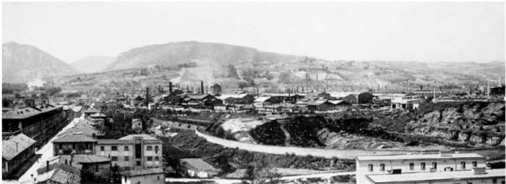
1: View of the iron and steel plant in Terni, May 1948 [original name and location: Terni, Archivio Storico Acciai Speciali Terni, B. 1304, Panoramica degli stabilimenti siderurgici di Terni].

National Navy fell upon the city of Terni. This decision is the result of policies external to Umbria region [Secci 1958, 11-22; Covino 1973-76, 87-140]: the detachment is still visible today, observing a city which has a local dimension and, inside it, factories faced to international economies (Fig. 1).