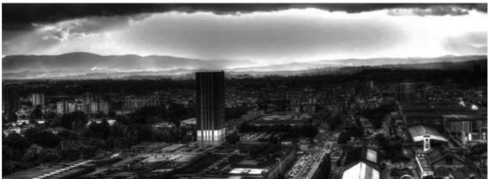
2: Comparison between the city in the early years of the 19th century and the today cityscape. On the top: Terni, view of the iron and steel plant, 1908 [original name and location: Terni, Archivio Storico Acciai Speciali Terni, 1, 178, Terni, stabilimento siderurgico, panoramica]. On the bottom: View of the AST steel plant.