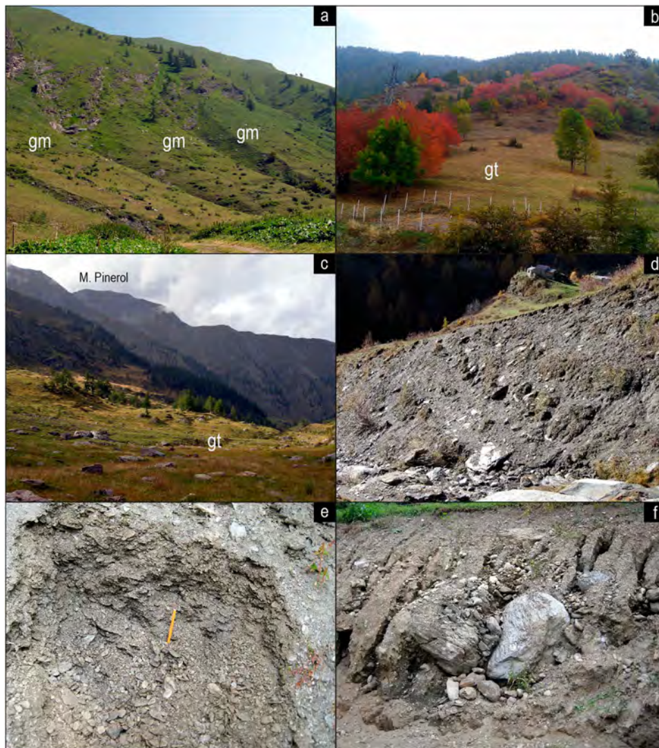
Figure 2. (a) Regular slope forming the LGM glacial mountainside (gm) (NE of Balma). (b,c) Serrevecchio and SW slope of the Escafe Valley glacial terraces (gt) corresponding to relicts of the LGM glacial valley floor. (d,e) Subglacial sediments outcropping NE of Balma, characterized by a coarse-grained texture, scarcity of matrix and subangular clasts with arrangement according to the glacial slope. (f) Subangular to subrounded boulders and cobbles and coarse-grained matrix forming the subglacial sediments in the Serrevecchio terrace. The glacial shaping of the Rodoretto Valley left grassy slightly inclined slopes (a–c) and grey sediments (d–f), formed by subangular to subrounded clasts and poor matrix.

calcschist, metagabbro and other metabasic rocks (essentially ‘ prasinite ’ Auct. ), gneiss, quartz-micaschist clasts, with rare serpentinite and dolomitic marble. This various composition of the sediments, the large dimensions of moraines (which are particularly wide around Arnaud where a large frontal moraine system developed) and their location in the lower Rodoretto Valley, suggest the occurrence of other diffuence phenomena of the Germanasca Glacier. In this case, the diffuences occurred along the watershed with the Rodoretto Valley, through the Clot della Rama glacial saddles (see Figures 7(d) and 8(a) ). Several small concentric frontals ( Figure 3(c) ) and lateral moraines (which are tens of metres long and metres high) ( Figure 3(b) ), essentially formed by calcschist clasts, are also preserved in the upper and middle Rodoretto Valley and its tributaries. This monotonous composition, in addition to small