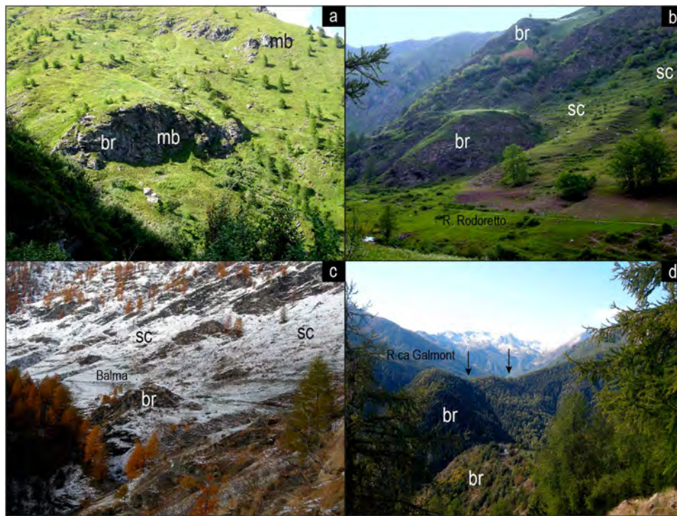
Figure 7. Different scales of bulging reliefs (br) characterized by a prominent rocky ridge partly covered by subglacial sediments (a: Comba Scura, b: W of Rimas, c: Balma, d: Rocca Galmont and Serrevecchio). (a) a metabasite body (mb) is displaced by bulging relief (br). (b,c) The bulging reliefs also cut the continuous subglacial cover (sc). (d) Rocca Galmont and Miande glacial saddles connected to diffuence phenomena of the Germanasca Glacier are also reported (arrows). Rocky reliefs hanging on the grassy glacial slope consist of significant gravitational morpho-structures (a–d) known as bulging reliefs

bulging reliefs can be directly evaluable where the bedrock comprises different lithologies involved in gravitational movements (e.g. Comba Scura, metabasic rocks versus calcschist displaced of about 50 m) (mb in Figure 7(a)) or where this displacement breaks glacial landforms and sediments.