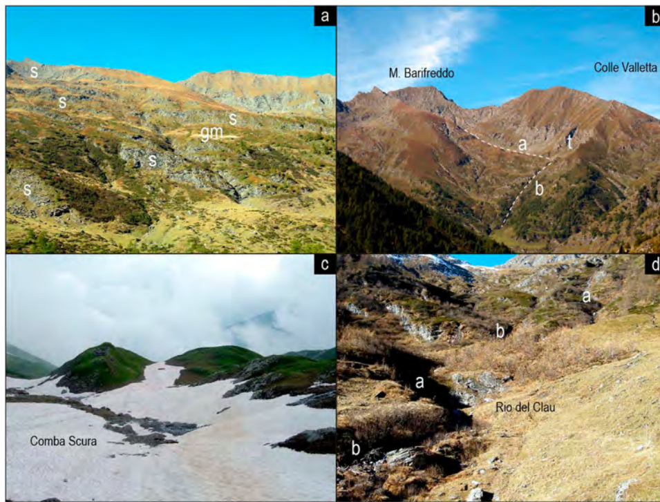
Figure 6. (a) Scarps forming steps (s) along the N50° fracture system dislocating the glacial mountainside (gm) (M. Barifreddo eastern slope). (b) NE of M. Barifreddo segmented valley developed along the fracture systems oriented N50° (a) and E–W (b); a wide N140° trench (t) occurs near Colle Valletta. (c) Snow accumulation (preserved after summer) in the Comba Scura gravitational valley. (d) Segmented trend of R. del Clau along the N50° (a) and E–W (b) fracture systems. Several scarps displaced the slope of glacial valley (a) and watercourses developed along the gravitational open fractures (b,d), that also favour the snow accumulation (c).

uncommon evidence of DSGSD evolution (m in Figure 5(e)). Locally, upstream plunging steps associated with scarps, are evidence of counterscarps , giving rise to gravitational saddles along the watersheds (e.g. N of Arnaud) (c in Figure 5(d)).