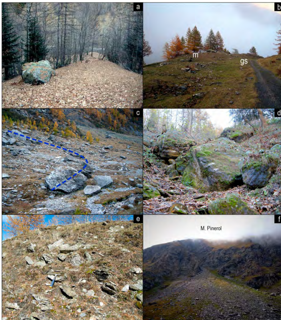
Figure 3. (a) LGM frontal moraine south of Rodoretto, with a metabasite boulder on the summit. (b) LGM lateral moraine (m) northeast of Bergeria Balma, bordered by a glacial spillway (gs). (c) Holocene reshaped frontal moraine at the outlet of the Escafe Valley, evidenced by a curved arrangement of large calcschist boulders (dashed line). Ice-marginal sediments formed by (d) large from subangular to subrounded boulders (SW of C. Saras) and (e) decimetric subangular clasts showing preferential arrangement (SE of Bergeria Balma). (f) Landslide sediments forming a wide fan south of M. Pinerol. The Rodoretto glacial tongue, full of debris, also left an asymmetrical elongated ridge, several metres high, read as a moraine (a–c), constituted by subangular clasts (d,e). A wide landslide fan (f) was formed subsequently the glacial shaping, supplied by the high slope.

forming the small-sized moraines at the head of the main valley and its tributaries, which are everywhere well preserved, were instead deposited by the small local glaciers that occurred during the Late Glacial-Holocene.