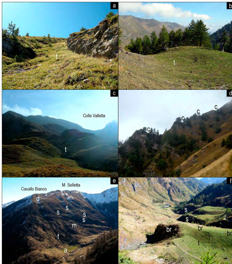
Figure 5. (a) Longitudinal trench (t) mainly connected to distancing of fracture sides (the two rocky walls, S of Prati dell’Orso). (b) Party filled transversal trench (t) along the bulging relief west of Bergeria Balma. (c) Transversal trench (t) south of M. Pinerol. (d) Counterscarps (c) evidenced by gravitational saddles N of Rimas. (e) Cavallo Bianco doubled ridge (d) continuing in a longitudinal trench (t) which supplies a wide avalanche fan (a) and location of scarps (s) and a tilted moraine (m). (f) Scarps (s), displacing moraines, and trench (t) involving a bulging relief (br) in the Rodoretto Valley floor SW of Balma. An elongated depression developed along a gravitational trench (a–c), while saddles on the watershed evidenced several counterscarps (d). Rocky walls and an elongated depression instead underlined gravitational scarps and trenches (e,f).

glacial evidence (e.g. watershed N of Arnaud) (arrows in Figure 4(f)).