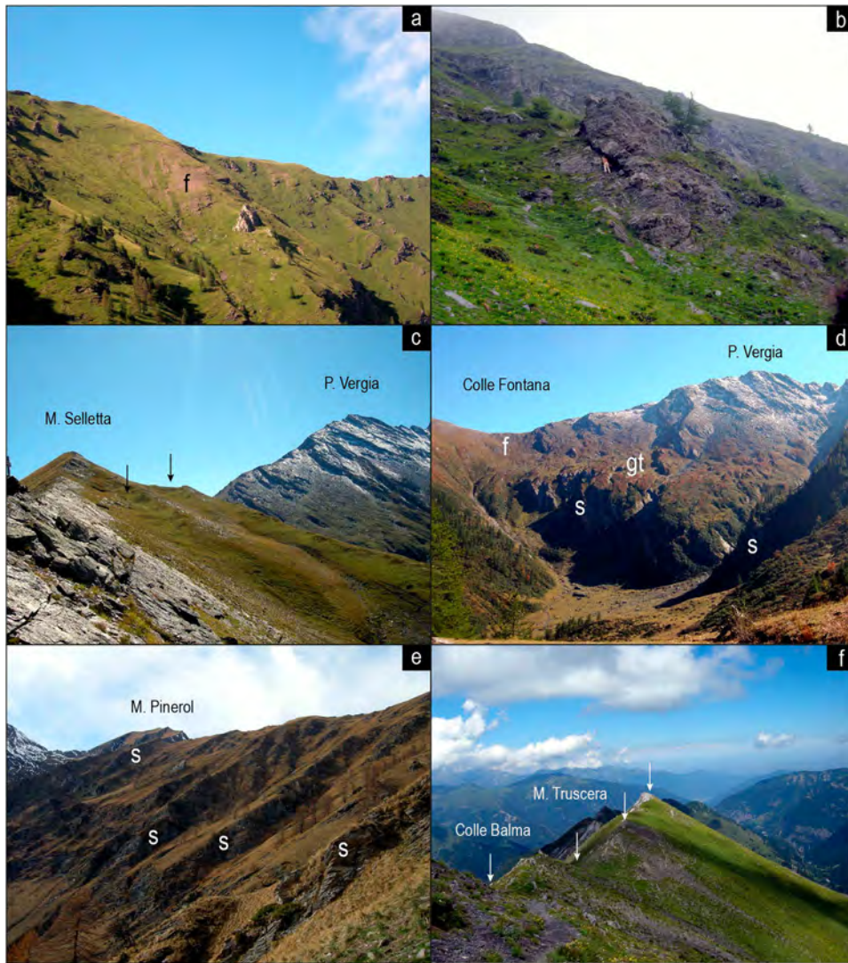
Figure 4. (a) Strongly fractured rocks N of Balma (f). (b) N140 directed open fracture on the SW slope of Escafe Valley. (c) Doubled ridges on the Cavallo Bianco western slope, evidenced by two elongated depressions (arrows) partly filled by subglacial sediments. (d) Significant scarp (s) that displaces the wide glacial terrace (gt) along the SW slope of Escafe Valley also characterized by strongly fractured rocks (f). (e,f) N-S scarps displacing the northern slope (s) and watershed (arrows) of Rodoretto Valley. The Rodoretto gravitational evolution created very fractured rocks (a) and morpho-structures on the slope as an open fracture (b), doubled ridges (c) and high scarps that displaced the mountainside (d,e) and watershed (f).

mixed composition in the Germanasca Valley. These sediments are deposited subsequent to the glacial shaping, during the Holocene.