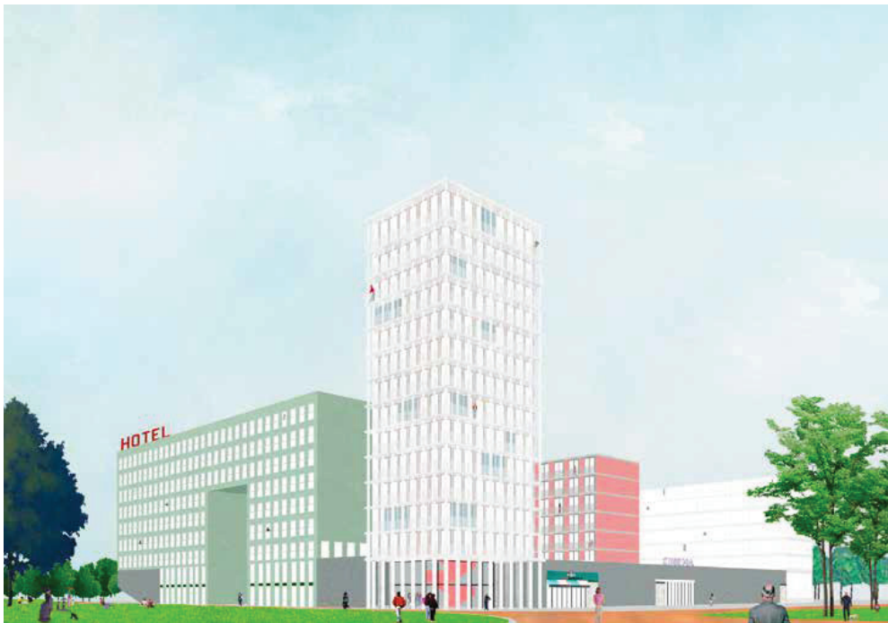
Fig. 3 | 'Of Enoughness: Islands' (credit: Simona Belluscio, Ahmed Mansouri, Riccardo Masala).