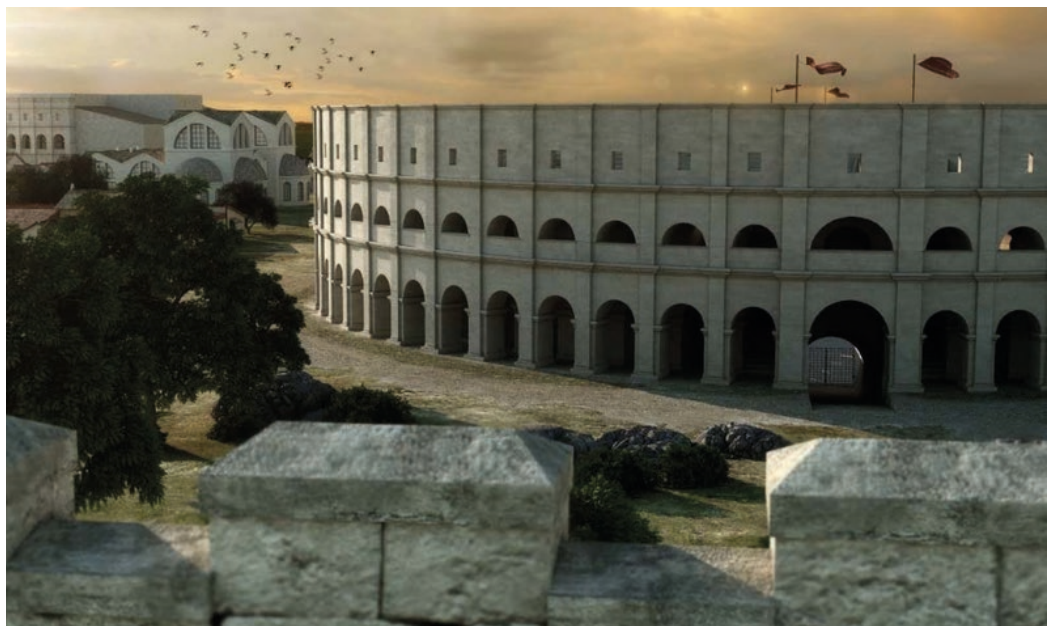
Fig. 1. Reconstructive proposal of the amphitheatre of Lecce. A frame of narrative approach – DiCet project [Gabellone 2015].

Secondly, we must ask about the economic feature of this technology. Design, configuration, and maintenance of VR and AR systems usually have very high costs; their use often requires large spaces dedicated, and qualified personnel who take care of their operation and use by the public. Therefore, it is an instrument in the economic possibilities of wealthy museum realities, able to sustain the technological investment; realities already