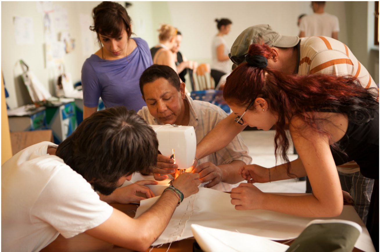
Figure 3. Sewing workshop: Citizens, both experiencing homelessness and otherwise, are sewing together during a “Costruire Bellezza” workshop.

with newness, and new nodes of network releasing from the isolation of homelessness (Campagnaro & Ceraolo, 2020; Petrova & Campagnaro, 2017; Porcellana & Campagnaro, 2019a).