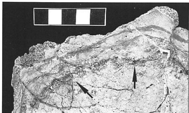
Fig. 2. Left parietal (endocranial). Traces of decomposition.

Eight individuals have been recovered until now: four male, two female, one subadult (around 16-17 years) and one infant. Average stature estimated is about 157 cm for females and 170 cm for males. The skeletons are in poor condition, showing differing degrees of preservation due to diagenetic events: only in two cases it was possible to reconstruct the entire skeleton and identify probable traces of decomposition (Fig. 2). Paleopathological analysis