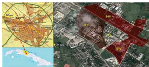
Fig. 1. ECCVC location in Sub Planta Neighborhood, Santa Clara, Cuba and Representation of land strata in satellite view.

Figure 1 shows the ECCVC location and the analyzed surrounding areas.