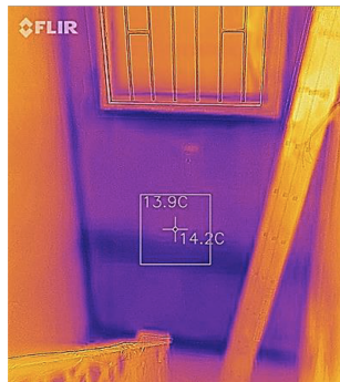
Fig. 2. Thermography of an external wall before the nanotechnology-based insulation.

between 0.040 and 0.050 W/mK . This value, associated with a thickness ranging between 4 and 5 mm, leads to a thermal resistance equal to 0.45 m^2K/W . A thermographic assessment of the walls showed that the average external wall temperature goes from 14°C before the treatment (Figure 2) to 18°C after the nanotechnology-based insulation (Figure 3).