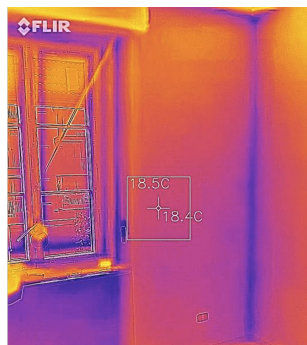
Fig. 3. Thermography of an external wall after the nanotechnology-based insulation.

During the house refurbishment, the wall radiators have been removed and a brand-new system has been created. The electric system switchboard that is supplied by the photovoltaic modules is connected with all the household plugs and appliances and the heat pump. The reversible heat pump generates the domestic hot water (DHW) used both in household utilities and in panel heating.