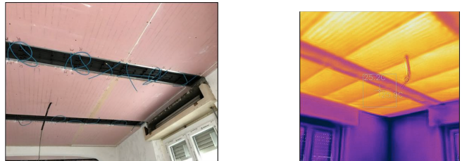
Fig. 1. Installation of the heating system (left) and thermography picture of the panels while working, by means of a thermoscanner (right)

A set of installations have been conducted to increase the energy and heating efficiency of the home while reducing waste. The first installation of the heating and conditioning system took place in the basements. The choice was a thermal system with energy generation based on a pellet stove. Then, for the rest of the house, radiant panels on the ceilings of the ground and first floor have been selected to allow the heating of three floors with just two series of panels. The panels have been applied to the false ceiling (Figure 1) to protect the load-bearing structures. The false ceiling leaves 5 mm of blank space to the ceiling, and it is 27 mm thick, supporting the 15 mm thick panels with a metal structure. The application of stucco and painting allowed the hiding of the panels to the residents' eyes. The chosen thermic plant is a reversible air-condensed heat pump, which can be used to both condition and heat the panels of the ground and first floors. Figure 1 depicts the panels heat generations.