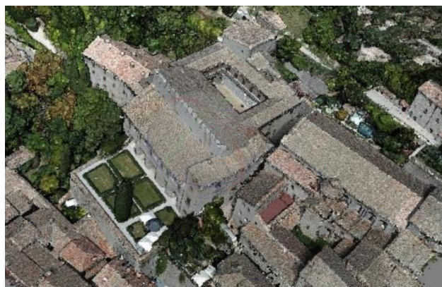
Figure 3. Photogrammetric point cloud

The LiDAR survey was performed whit a ToF TLS Faro Focus 3D S120 and a Faro Focus 3D X330, the error in distance measurement of these system is \pm 2\text{mm} ; 142 scans were acquired to cover the test area, and all of them have been acquired whit a quality 4x and a resolution of 1/5. These values correspond to 1 point every 8 mm at a distance of about 10 m (see Table 3 and Figure 4).