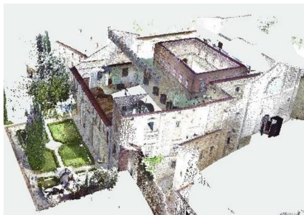
Figure 4. TLS point cloud

The Mobile Mapping System used to survey the test area was the ZEB Revo Real Time (RT). This instrument is an MMS based on a SLAM algorithm and is equipped whit a handheld laser scanner and a RGB camera. ZEB Revo Real time RT represent a rapid mapping solution: the survey of the entire architectural complex required only about 125 minutes. This system has been adopted to survey the most difficult areas of the building to reach through the use of TLS and characterized by little lighting so as not to allow perfect photogrammetric acquisition, such as the underground rooms of the buildings.