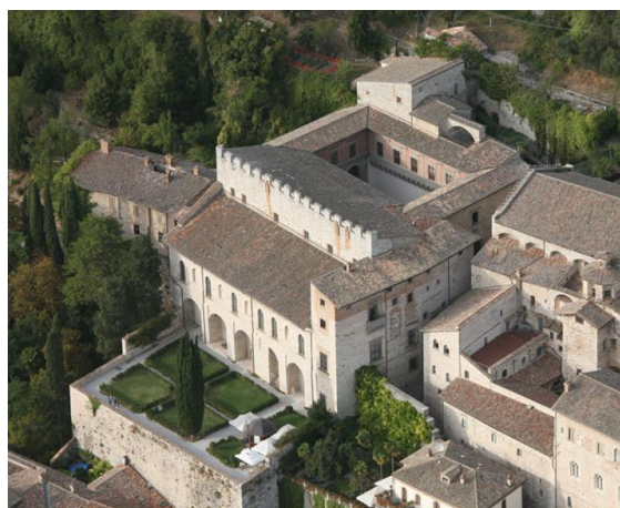
Figure 1. Aerial view of the Palazzo Ducale

The architectural complex of the Palazzo Ducale, located upstream of the most important town square, faces the cathedral of Gubbio (province of Perugia) in a very complex urban context (see Figure 1).