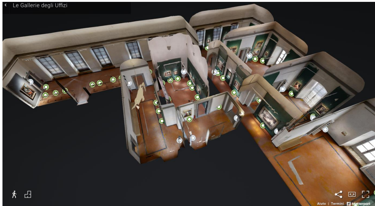
Fig. 2: View of the virtual tour inside Le Gallerie degli Uffizi.

Among the numerous virtual initiatives available free of charge, the display of fifteen virtual exhibitions, including the 360° virtual tour of the Uffizi's new Venetian rooms, was particularly successful with more than 110 thousand people already virtually visited it, over 4,000 per day. As the Figure 2 shows, virtual tours were created through a faithful 3D reproduction of the rooms and a high-definition digitisation of the artworks. An immersive experience through some of the most beautiful and interesting spaces of the museum gives visitors from home the chance to admire the artworks as in a live tour, moving around the museum. They can follow the suggested route, or choose their own path, getting closer to each artwork and read the captions with the relevant information, while the main masterpieces are also accompanied by in-depth information and details for enthusiasts and scholars.