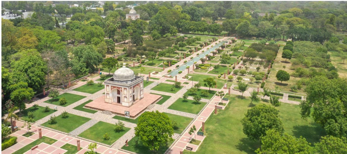
Fig. 1: View of the 90-acre Sundar Nursery garden, recently restored. (Author: Niveditaa Gupta)

were numerous initiatives of important National museums, State Departments of Archaeology and Museums and the Archaeological Survey of India at the Centre for digital outreach, and also an increased emphasis on improvement of local sites in each town or rural area, rather than a focus on more prominent sites [5]. However, large complexes such as the World Heritage Site of Humayun's Tomb with the Sundar Nursery also became increasingly popular, due to the perception of increased safety during the pandemic associated with the vast, sensitively designed open spaces of the public parks within the historic complex.