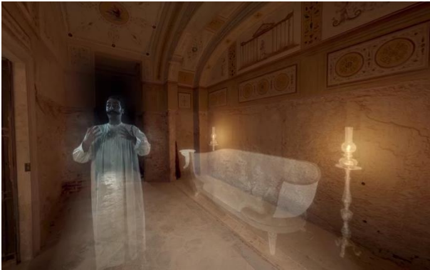
Figure 5: VR image of King Carlo Alberto's ghost and furniture

The actors who played these roles shot the various scenes on the green screen, in pre-established positions, following narrative, compositional and functional logics. The characters inserted in post-production in the virtual environments together with the furniture were modified to transform them into the ghosts of the past. The sound element is also important in the experience because it manages to direct the visitor's attention to the precise point where the narration takes place, through the spatialisation of the audio, despite the freedom of exploration.