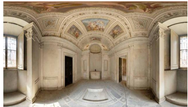
Figure 2: King Carlo Alberto's thermal baths in pre-restoration phase

scenography of the experience is in fact constituted by the images of the rooms in their pre-restoration state, augmented by the introduction of characters, moving machines and objects from the past.