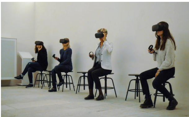
Figure 8: Test of VirgilTell experience with museum staff

The experience takes place in spaces adjacent to the restored site, where there are 8 stations set up for the virtual visit using Oculus Quest. During the visit, visitors are seated in swivel chairs that provide the physical support necessary to view the experience without incurring episodes of physical fatigue or disorientation, dizziness or collisions with other members of the group and the surrounding environment.