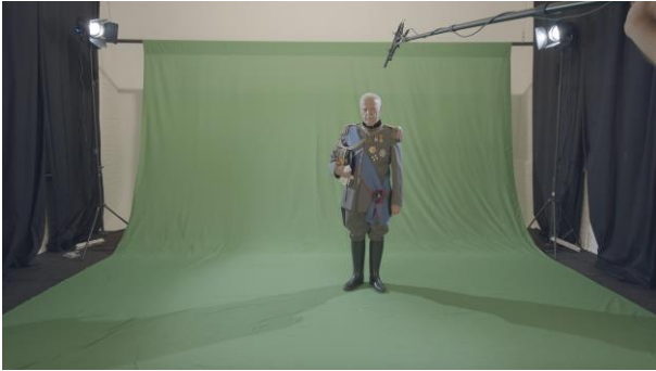
Figure 4: Green screen shooting of actors in historical dress

contributed to the informative-didactic and narrative enrichment of the virtual experience, lightening the stories with courtly gossip.