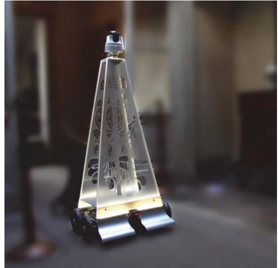
Figure 1: Virgil Robot

common to many museums, which had to close parts of the tours because they were not safe for users. The VirgilTell experience intends to replace only temporarily those areas that cannot be visited by users, providing a different, augmented and interactive experience.