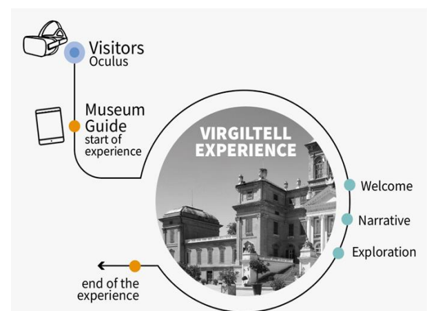
Figure 3: General schema of VirgilTell experience

The different steps of the project included a photogrammetric reconstruction of the environments, cleaned of transfigurative and obscuring elements, through 360° images. In the 3D rebuilding operation, the images were superimposed on the meshes of the simplified volumes of the thermal baths of Carlo Alberto. The environments were reconstructed in 3D on the modelling program Blender, and the result obtained was integrated with the elements useful for the scenography: from the lighting, which gives a dark and mysterious photography, to the furniture and objects of the scene. The project attempted to digitally reconstruct the furnishings that were present at the time in those places, now destroyed, through the drawings and inventories of the architect Pelagio Palagi.