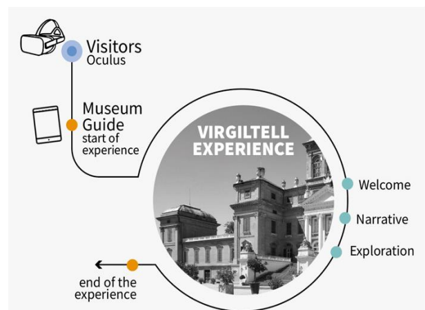
Figure 3: General schema of VirgilTell experience

The different steps of the project included a photogrammetric reconstruction of the environments, cleaned of transfigurative and obscuring elements, through 360° images. In the 3D rebuilding operation, the images were superimposed on the meshes of the simplified volumes of the thermal baths of Carlo Alberto. The environments were reconstructed in 3D on the modelling program Blender, and the result obtained was integrated with the elements useful for the scenography: from the lighting, which gives a dark and mysterious photography, to the furniture and objects of the scene. The project attempted to digitally reconstruct the furnishings that were present at the time in those places, now destroyed, through the drawings and inventories of the architect Pelagio Palagi.