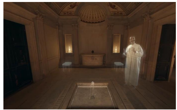
Figure 6: VR image of King Carlo Alberto's ghost on stage

and all the furnishings that used to fill the room. Here the life of the court is illustrated and the functioning of one of the machines of the time, still present in the room, is shown in action through an animation. The tour continues in the other rooms, where Benedetta continues with her story, until King Carlo Alberto and then King Vittorio Emanuele III enter on stage. The three timelines on which the narrative unfolds intertwine throughout the experience: the first line is represented by the moment when the visitor participates in the exhibition of the places during the restoration phase; the second, set in 1842, coincides with the appearance of Benedetta and King Carlo Alberto; the last time jump is to 1920, represented by the appearance of King Vittorio Emanuele III, who will take the place of King Carlo Alberto in the last room.